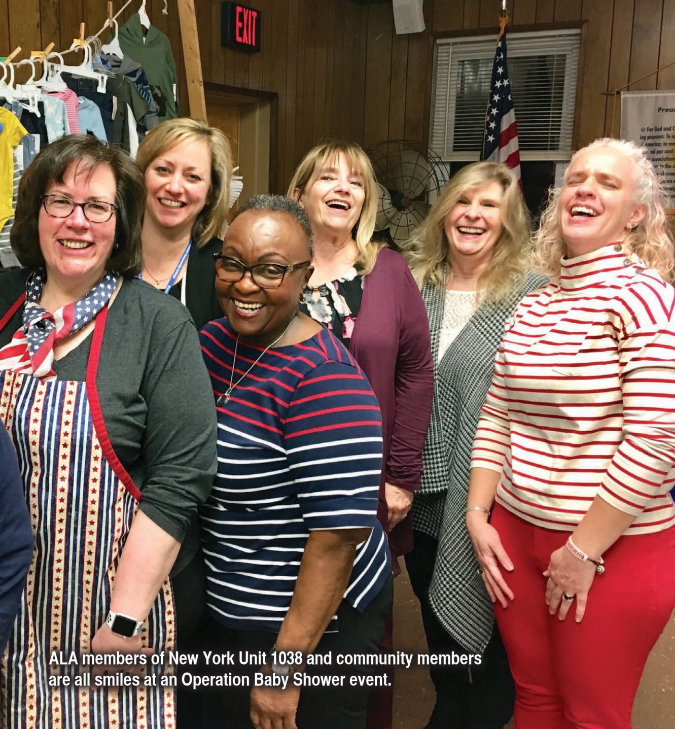
ALA members of New York Unit 1038 and community members are all smiles at an Operation Baby Shower event.