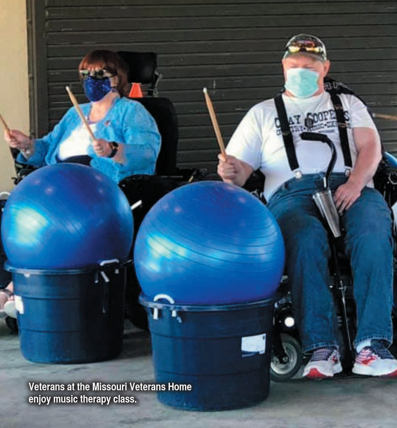
Veterans at the Missouri Veterans Home enjoy music therapy class.

In more than a century of selfless service, our mission to support our nation's veterans, military, and their families has not wavered. Whether you give to honor a loved one, because you have served, or simply because you believe in the mission of the American Legion Auxiliary, we are grateful. Your contributions lifted the financial burden from members in need by providing nearly $134,000 in Auxiliary Emergency Fund grants, gave hope and opportunity to young, deserving students through $155,500 in scholarships, and made a major impact on the lives of countless veterans, military, and their families across the country. None of this was possible without YOU.