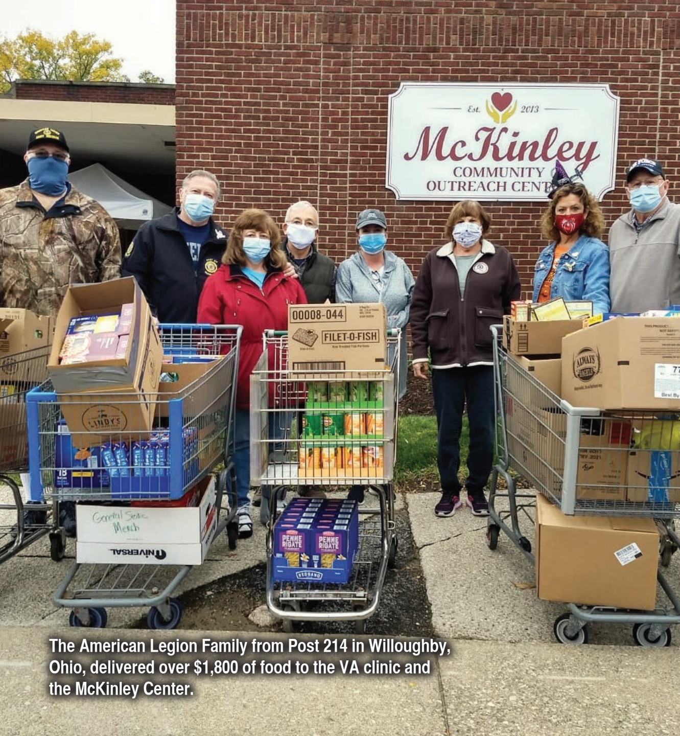
The American Legion Family from Post 214 in Willoughby, Ohio, delivered over $1,800 of food to the VA clinic and the McKinley Center.

We invite you to join Heroes Giving Hope — a group of individuals committed to providing long-term support for our veterans, military, and their families through monthly donations. We are so grateful for the donors on the following pages who have become a Hero . . .