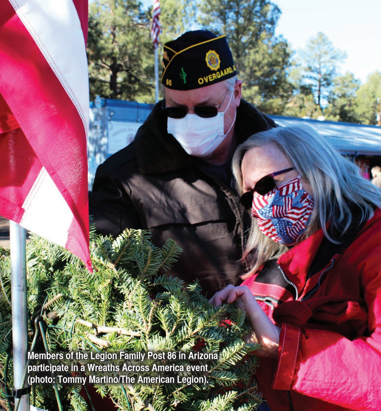
Members of the Legion Family Post 86 in Arizona participate in a Wreaths Across America event.