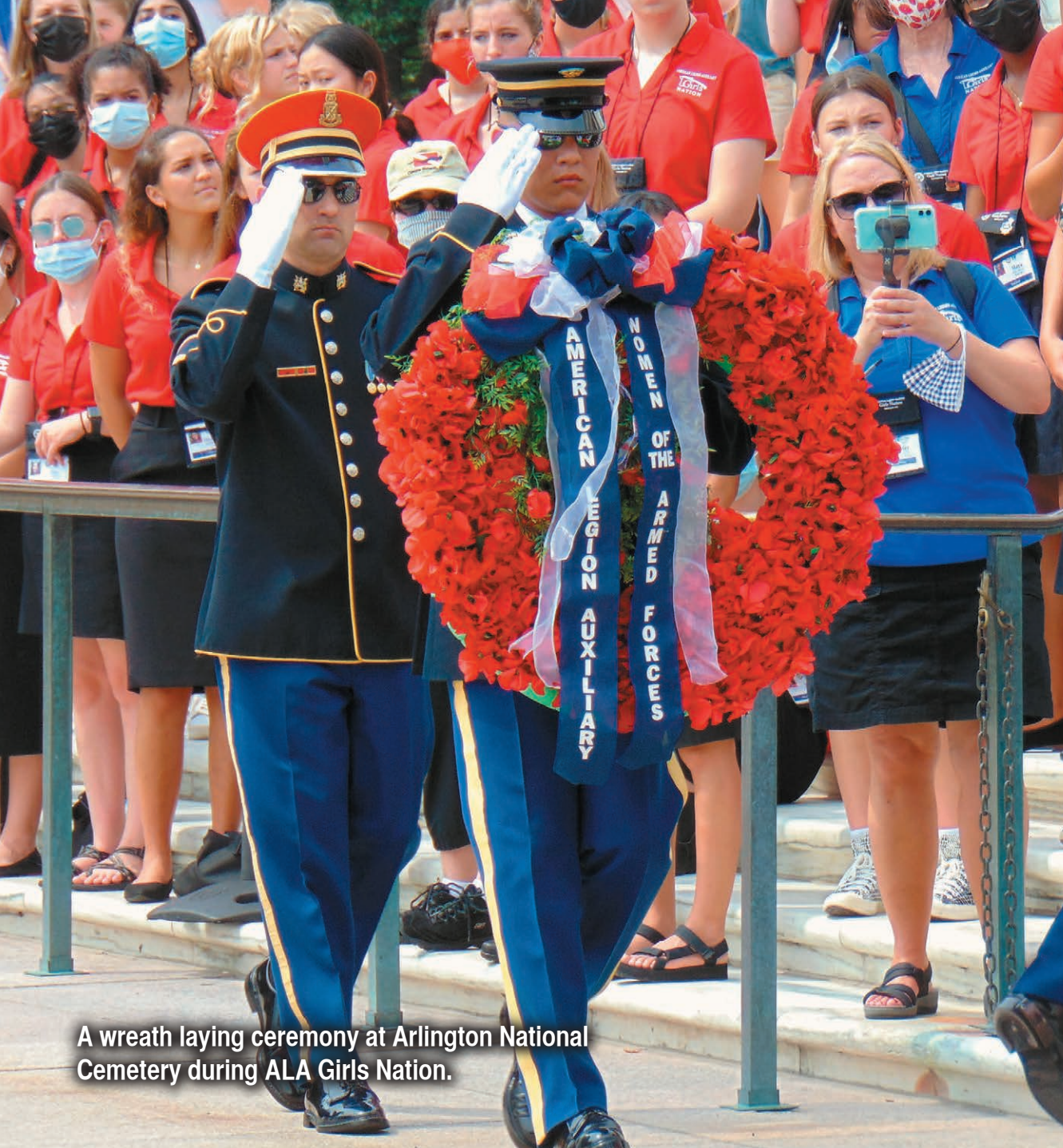
A wreath laying ceremony at Arlington National Cemetery during ALA Girls Nation.