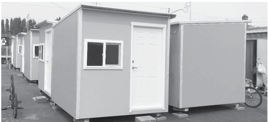
Olympia's new micro shelters at the downtown mitigation site.

The city developed a downtown mitigation site on a city-owned parking lot that includes 115 spots for individual tents, potable water, and portable toilets. Catholic Community Services provides oversight under contract. The city reports a $50-$70,000 startup cost and $200,000 annual operating costs. The mitigation site has a code of conduct that includes requirements, such as no drug dealing.