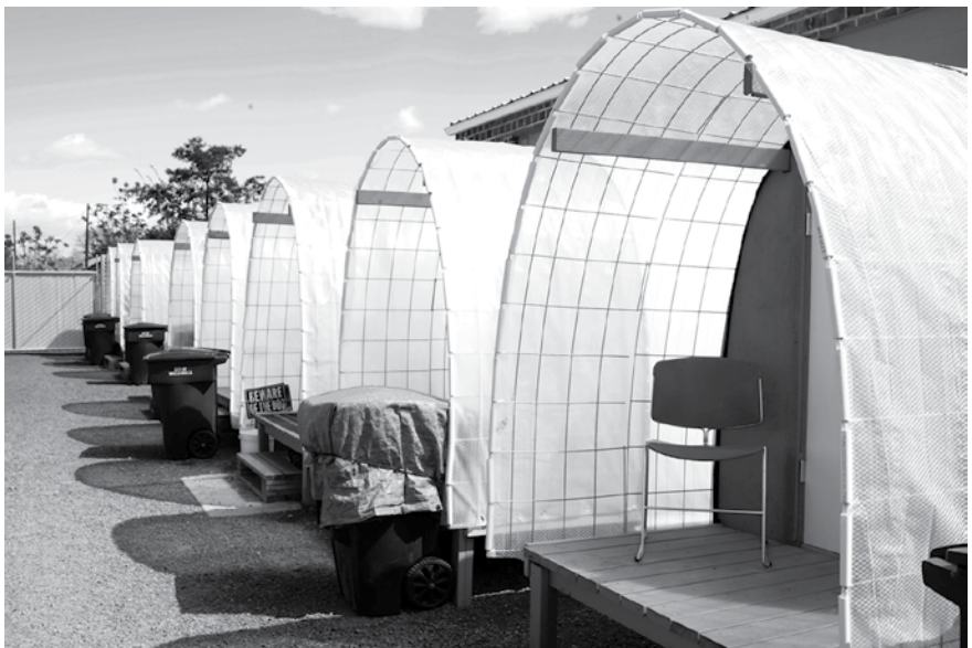
Walla Walla's Conestoga Huts.

The village has 29 tiny houses for single adults and couples without children. The tiny houses are each 8’ x 12’, insulated, have electricity and heat, windows, and a lockable door. There is also a security house, a communal kitchen, meeting space, bathrooms, showers, laundry, a case management office, and 24/7 staff providing security and management. Residents