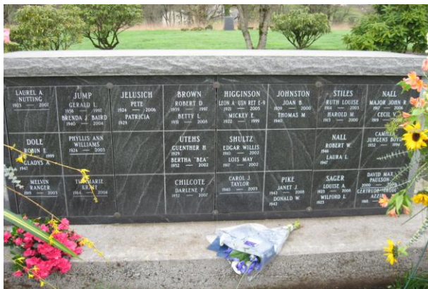
WEST WALL – PHASE 2 (3 x 8 configuration)