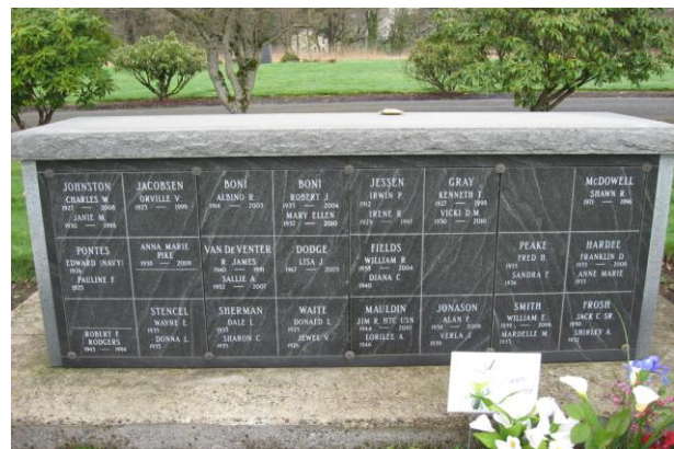
EAST WALL – PHASE 2 (3 x 8 configuration)