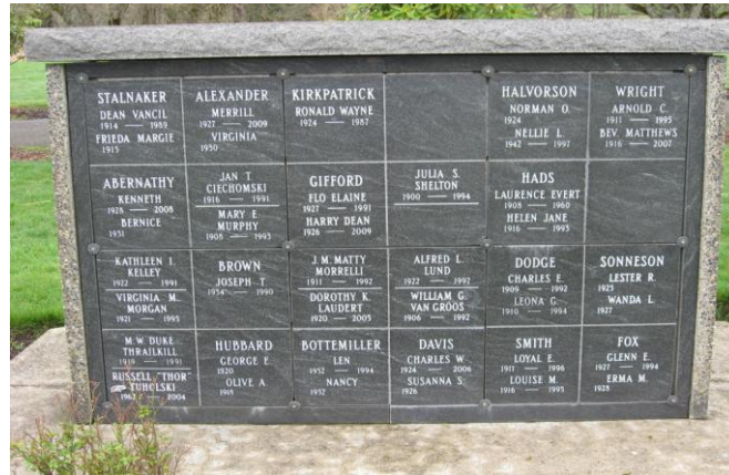
ORIGINAL COLUMBARIUM (4 x 6 configuration)