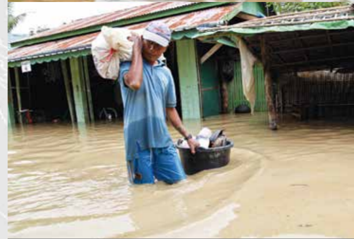
People carry their belongings through flooded streets in Min Pyar township, in Myanmar’s Rakhine state, after weeks of heavy rain. At least 60 people drowned and more than 520,000 acres of farmland were damaged across 12 of the country’s 15 states.