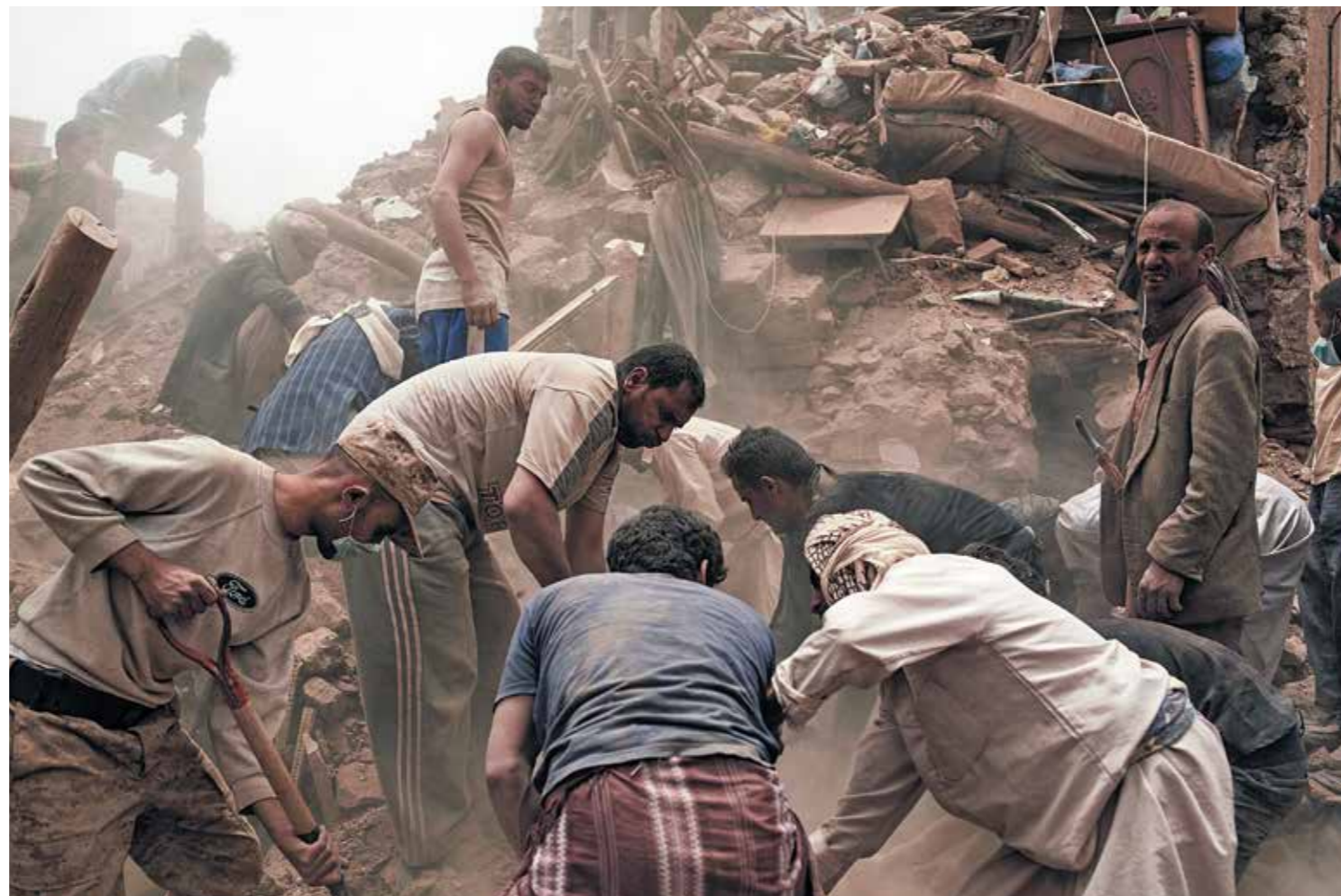
12 June 2015: In Sana'a, local people clear the rubble of four houses destroyed by a Saudi airstrike. Six people were killed and an unconfirmed number are missing.

"I've been camping out in the office of a hospital, with the idea that it's the safest place to sleep and won't be a target."