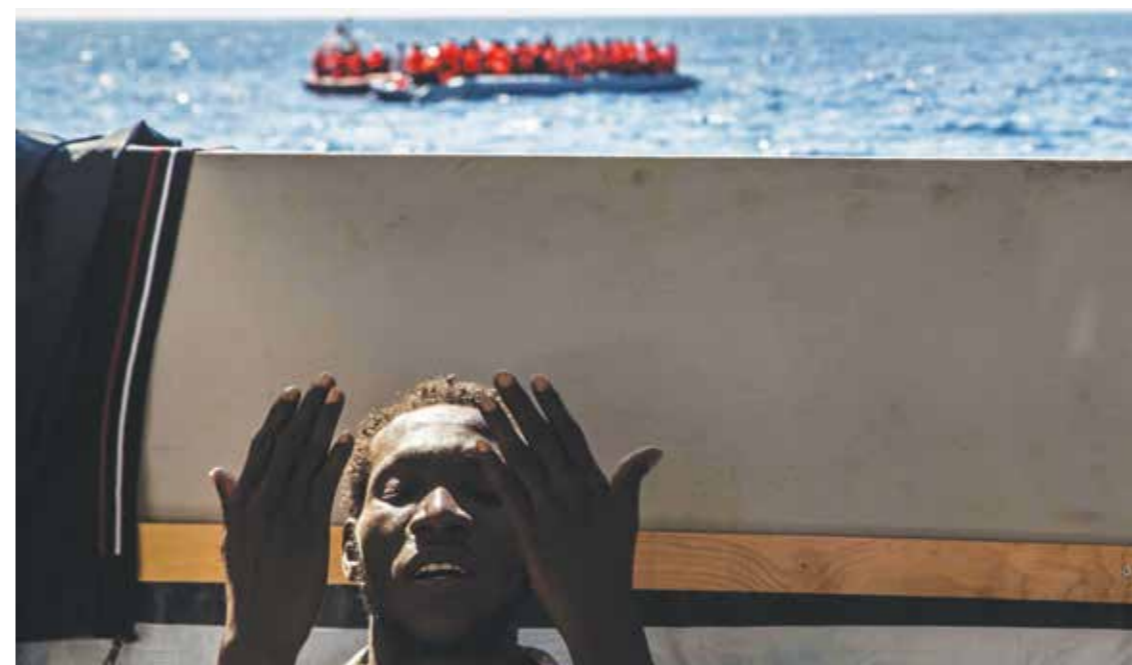
19 July 2015: A man on Dignity I offers thanks after being rescued from a dinghy with 110 people on board.