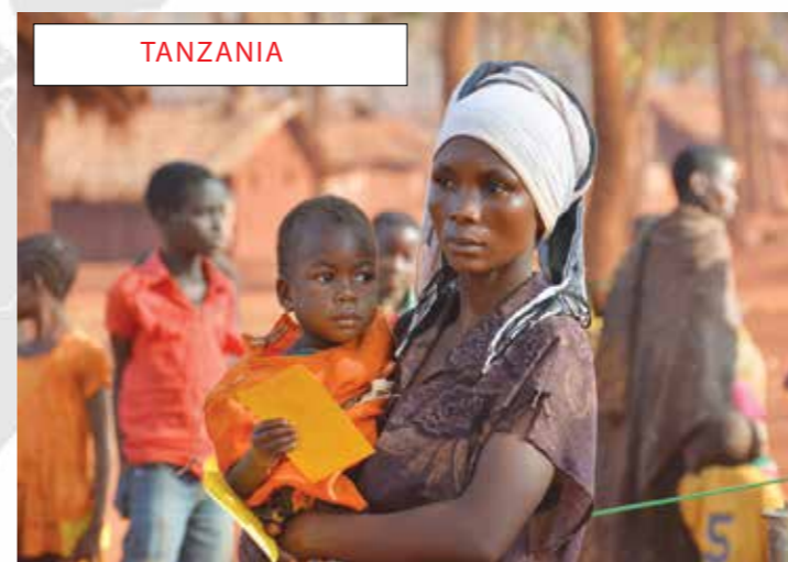
MSF teams have carried out a cholera vaccination campaign in Nyarugusu camp in Tanzania, which shelters refugees escaping violence in neighbouring Burundi. Cholera broke out in the camp in May, and to prevent a second outbreak, the teams vaccinated some 130,000 people in less than a week against the waterborne disease, which can spread quickly in overcrowded conditions.