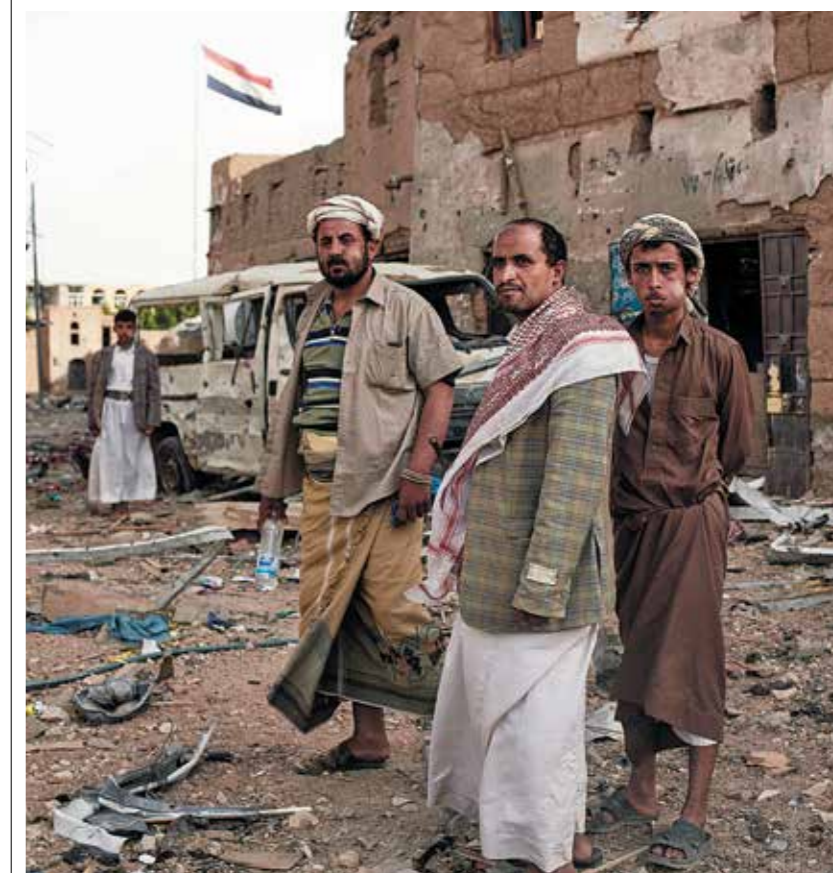
15 June 2015: Local people walk through the destroyed city of Sa'ada, which has been hit by daily airstrikes since Saudi-led coalition forces declared the entire area a "military target".

"I have a big MSF flag on top of the car. I just hope the pilots have good vision."