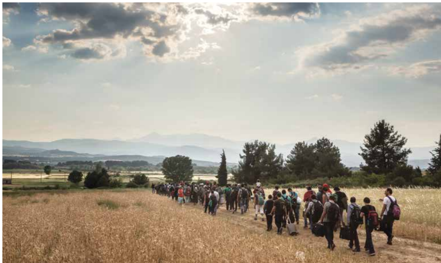
6 June 2015: Some 150 Syrians set off to cross from Greece into the Former Yugoslav Republic of Macedonia, in the hope of applying for refugee status in countries such as Germany and Sweden. As the Greek border with Macedonia is increasingly under the control of people-smugglers, people cross in large groups to protect themselves from threats and extortion.