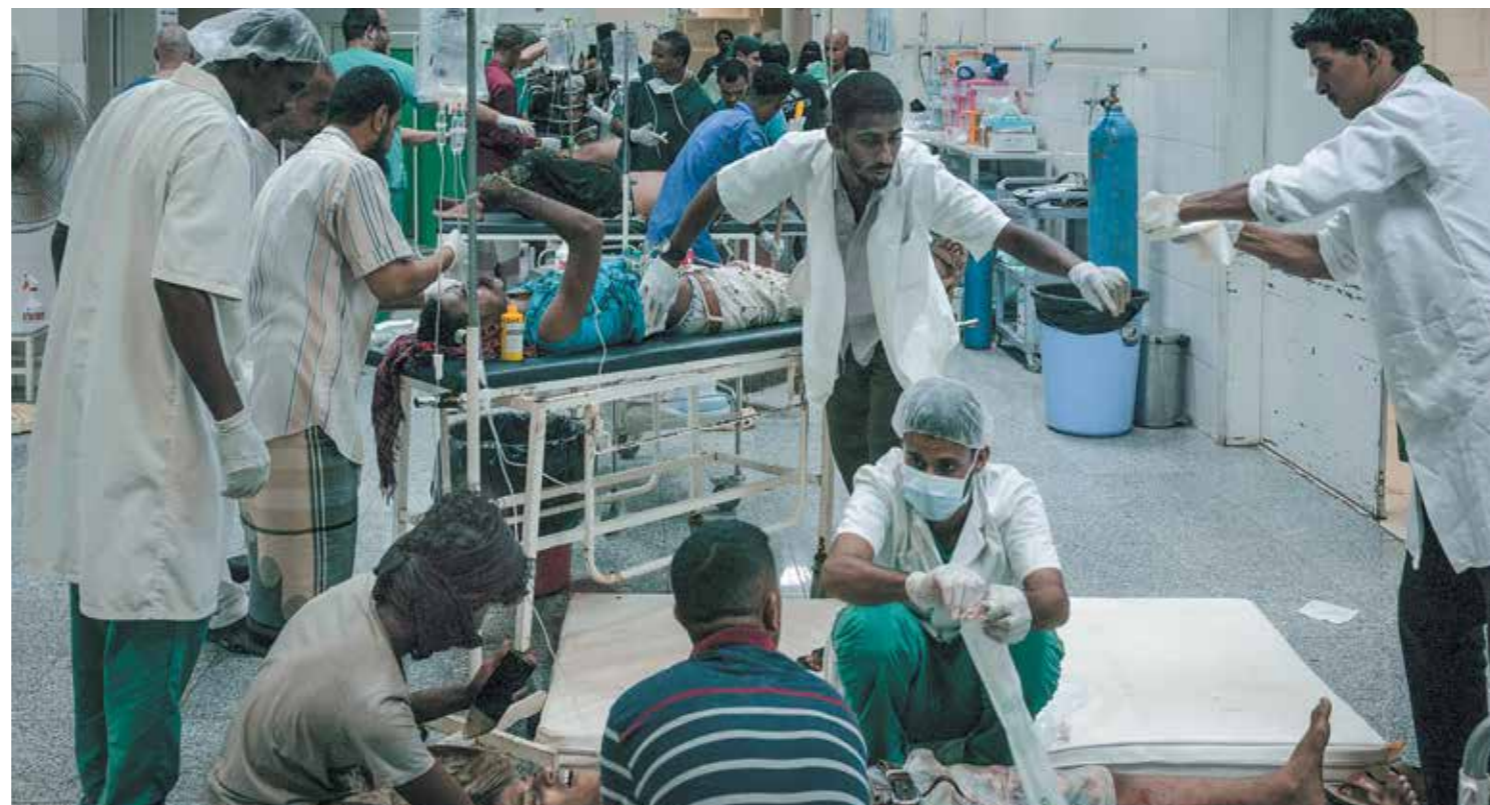
1 July 2015: An MSF team treats wounded patients in MSF's hospital in Aden. Accessing medical care in the city is extremely difficult due to airstrikes, shelling, roadblocks and snipers. MSF has opened an advanced emergency post in Crater, in the south of the city, and runs mobile surgical clinics in two other neighbourhoods.

There's a six-year-old boy here with a piece of shrapnel in his eye. We're going to have to take him to Sa'ada for treatment, probably to remove the eye, which is unpleasant. He's lying on his bed and is being very brave. He's still covered in blood but fortunately his mother is with him. They've already