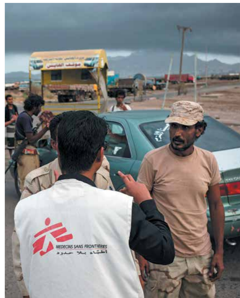
An MSF team negotiates with armed men at a checkpoint in Aden.

This is the first place I've been to where I haven't met a journalist at all. This is a conflict that's just not in the public eye. But the public should really be aware of the crisis that is happening in this country, and the difficulties of trying to help the people living here. I feel like the whole world needs to understand what's going on.'