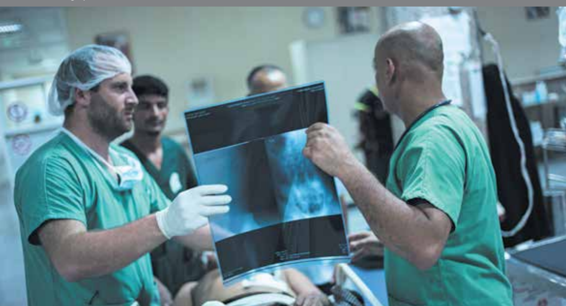
MSF staff examine the X-ray of a wounded patient in the emergency room of MSF's hospital in Aden.

The staff are now exhausted. But the surgical teams are doing an amazing job and the emergency team is tremendous. Thanks to the entire MSF team, this project is having a significant impact. They have saved many, many lives and are continuing to do so.'