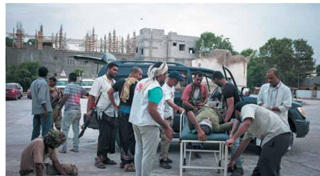
An injured man is loaded onto a stretcher outside the emergency room at MSF's hospital in Aden. MSF has been running the emergency surgical hospital since the beginning of 2015.