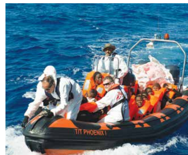
29 July 2015: An MSF team transfers a group of women and children from a dinghy to the MY Phoenix.