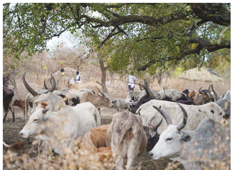
▼ Children watch as the MSF team set up a mobile clinic. Malaria, pneumonia and diarrhoea are the leading causes of death among children under five in South Sudan. To make sure that some medical care is available in even the remotest places, MSF has trained community health workers to diagnose symptoms and administer basic treatment and medicines.