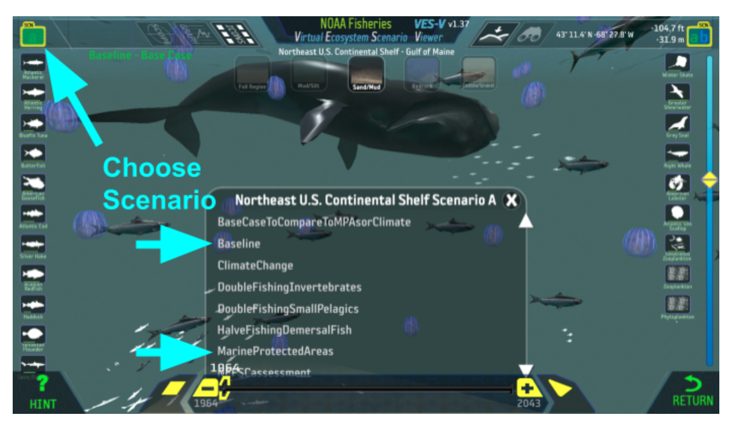
VES-V Screenshot 8: Selecting a scenario within a habitat.

12. Click the green icon in the upper left, that looks like a file folder and has the letters SCN on it, to choose a different scenario. A list of scenario options appears in the center of the screen. In general, VES-V starts with the "Baseline" scenario selected by default. Click on a different scenario, such as "MarineProtectedAreas", to switch. VES-V is now using a different dataset to populate the species displayed in the scene and to generate graphs of their populations over time. Most of these datasets are generated by models using different assumptions; such as changes in populations caused by changing ocean temperatures or an increase or decrease in fishing.