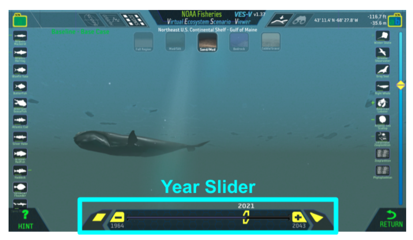
VES-V Screenshot 5: Adjusting the year of the VES-V visualization.

9. The yellow slider control immediately below the graph adjusts the year that the VES-V visualization displays. Drag it right or left to change the year. More or fewer fish and other species may appear as you move the slider, corresponding to the biomass for each year.