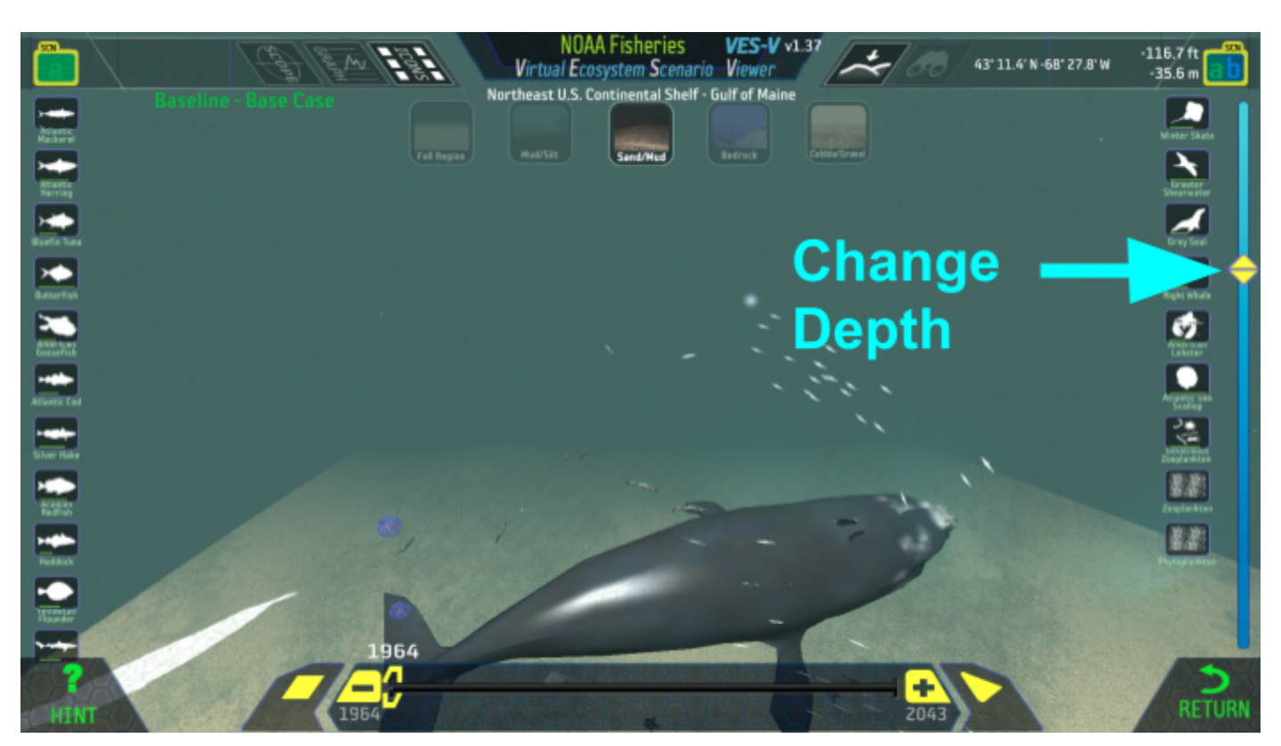
VES-V Screenshot 3: Navigating within an ocean habitat