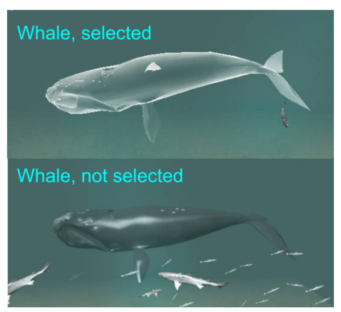
VES-V Screenshot 7: Selecting a specific species within a habitat.

11. Click on the selected species icon a few times. Notice how species of that type in VES-V switch between a ghostly white display and a normal, colored display as you select and de-select the species icon.