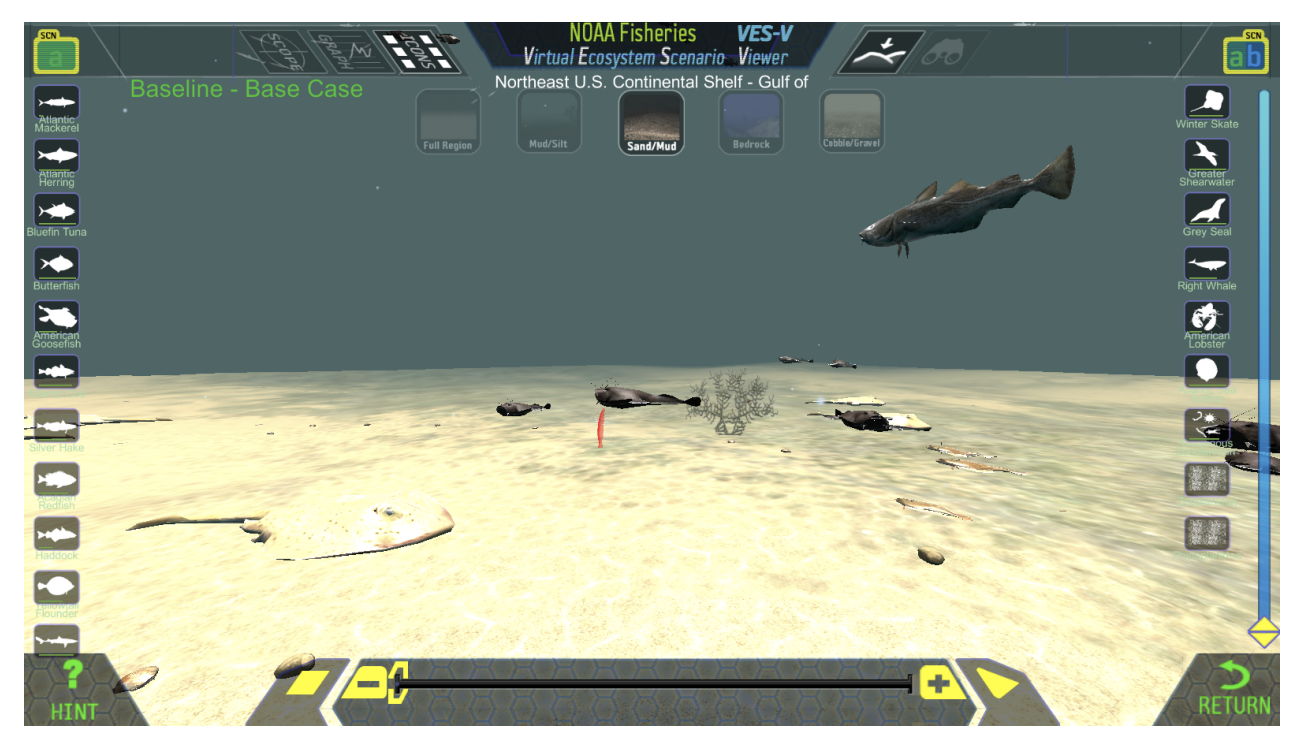
VES-V Screenshot 1: sand flats in the Gulf of Maine

There are two versions of VES-V: one that runs online in a web browser, and a second that can be downloaded to a local computer. We recommend the online version.