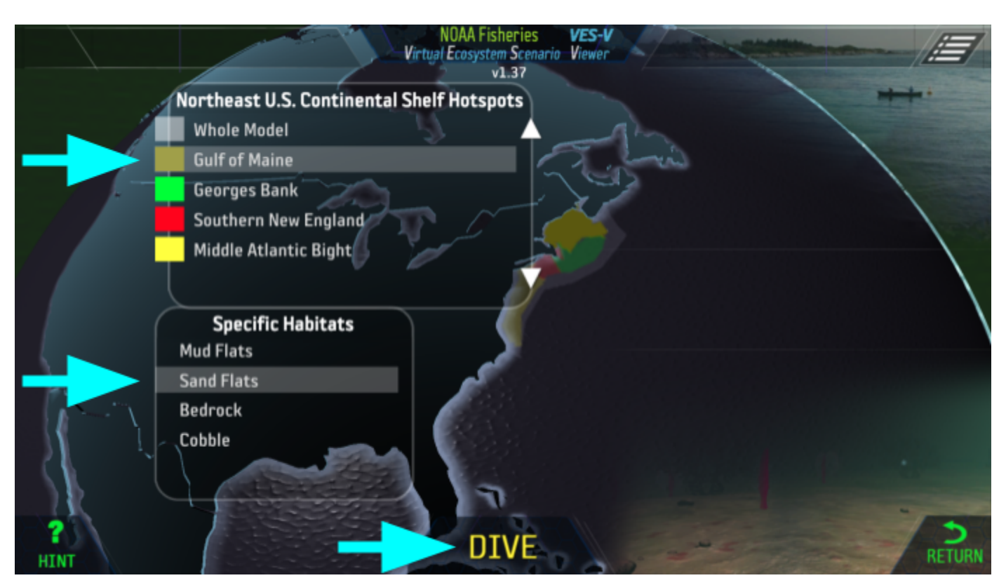
VES-V Screenshot 2: Navigating to different Ocean Regions and Habitats.

5. Hold down your mouse button and drag on the scene to look around - left, right, up and down.