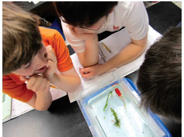
Figure 2. Fifth graders using indicator solution to see CO 2 levels in a mini-aquarium containing a goldfish and a plant.

environment. Students brainstormed environmental factors on the campus by drawing concept maps (Figure 1) of the inputs and outputs of the school. They decided to focus on air pollution from unnecessary idling in the carpool line.