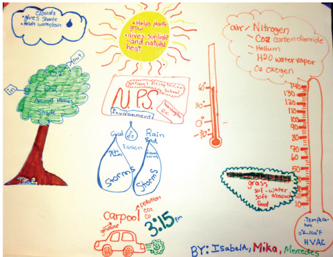
Figure 1. Student concept map showing environmental factors around the campus.