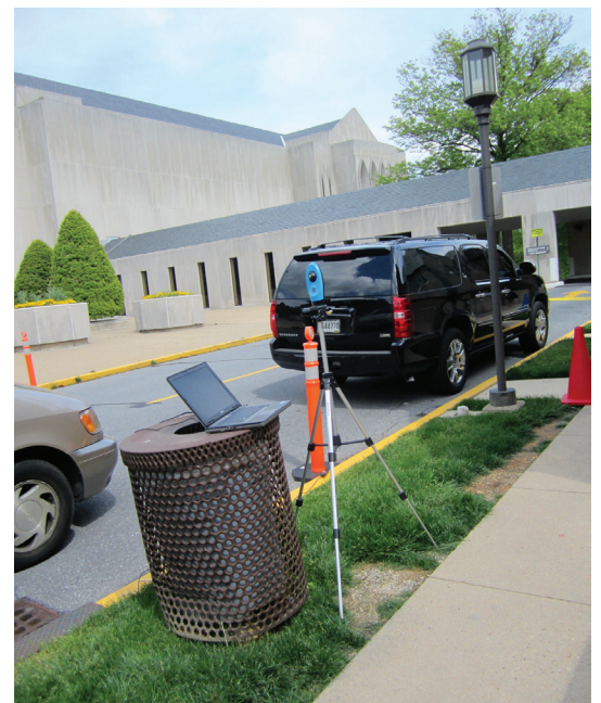
Figure 3. A laptop computer with two Vernier temperature probes and one CO 2 probe was set up in the carpool lane while a time-lapse camera recorded the arrival of cars.

Students reflected on their service and their learning during class discussion, assessments, interviews and surveys. They saw how their actions impacted the school community even beyond their initial goal. Academic achievement was assessed throughout the project with standard FOSS