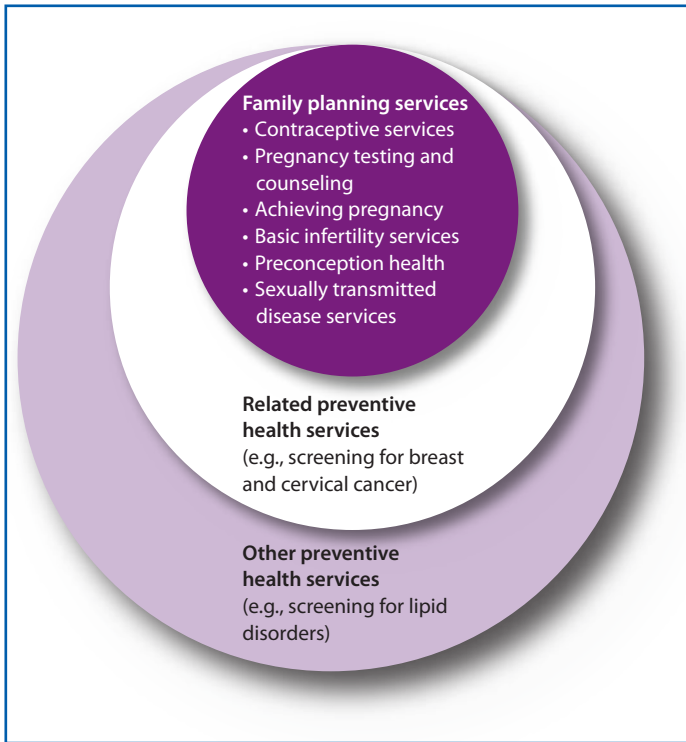
FIGURE 1. Family planning and related and other preventive health services

are closely linked to family planning services, and are appropriate to deliver in the context of a family planning visit but that do not contribute directly to achieving or preventing pregnancy (e.g., breast and cervical cancer screening).