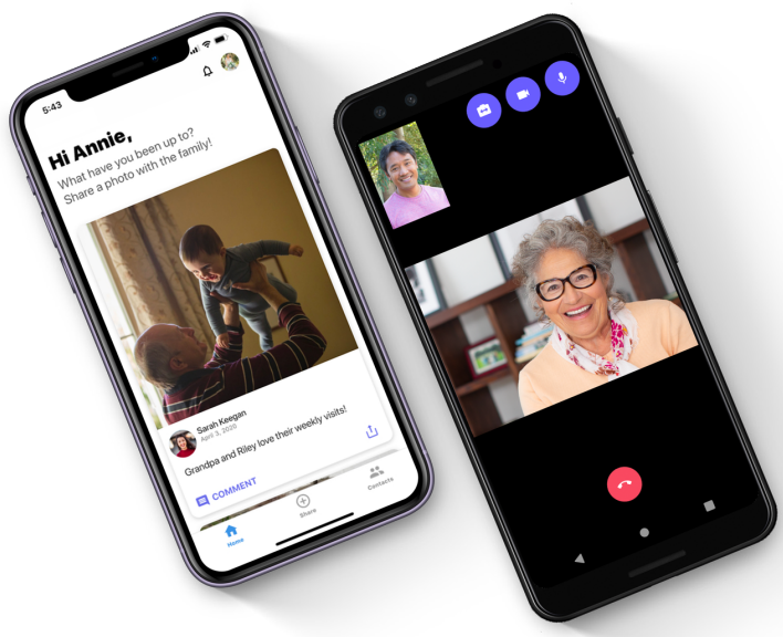
Img 2. Android and iOS apps

Languages that are currently available on the GrandPad tablet and app include: Afrikaans (Southern Africa), Albanian, Armenian, Catalan (Catalonia / Spain), Chinese (Simplified), Chinese (Taiwan), Chinese (Hong Kong), Czech (Czech Republic), Danish, Dutch (Netherlands), English (Canada), English (Ireland), English (UK), Finnish, French, German (Germany), German (Switzerland), Greek, Haitian Creole, Hebrew, Hungarian, Italian, Japanese, Khmer / Central Khmer (Cambodia), Korean, Norwegian, Polish, Portuguese (Brazil), Portuguese (Portugal), Romanian, Russian, Serbian, Spanish, Swedish, Tamil, Turkish, Ukrainian, and Vietnamese.