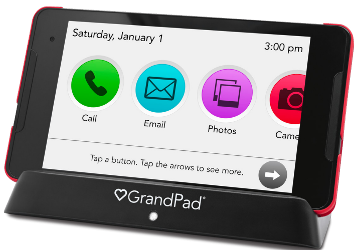
Img 1. The GrandPad tablet

capabilities in its tablet and free Companion App to include nearly 40 languages. The enhanced language functionality underscores the company's commitment to making technology accessible for all seniors — regardless of age, race, or ability level — and their caregivers.