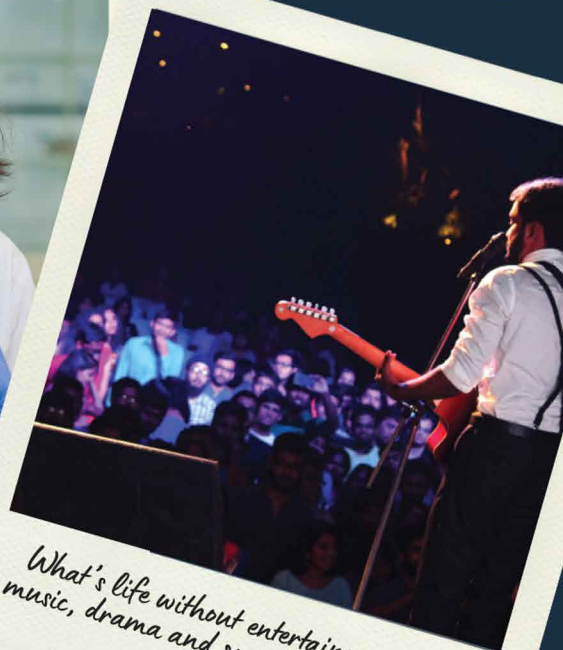
What's life without entertainment music, drama and so much more...