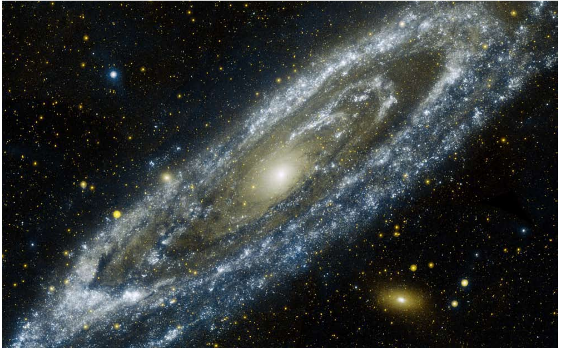
Andromeda Galaxy (M31)