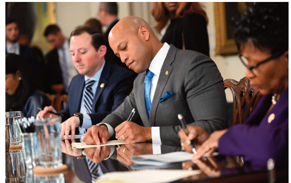
Governor Wes Moore signed the legislation on April 24. He is pictured with Senate President Bill Ferguson, left, and House Speaker Adrienne A. Jones.

An amortization policy is a component of a pension system's plan for accumulating enough funds to pay all current and future retirement benefits. An important part of this policy is the amount of contributions paid by employers who participate in the pension plan. Employers participating in the Maryland System include county school systems, some county and city governments, and