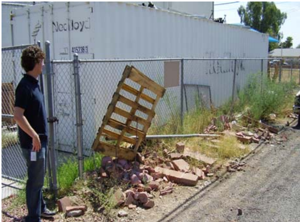
Lynnhaven - Before

The alley way clean-up at Lynnhaven was well received by nearby residents who used the opportunity to haul away old items, as well as for the church which removed items they had stored and no longer needed. Cleaning the alleyway was important for safety reasons to include removing weeds and construction rubble from a wall that had been knocked down. It was also essential to provide future access that will be needed by the staff that will be preparing and painting the wall mural.