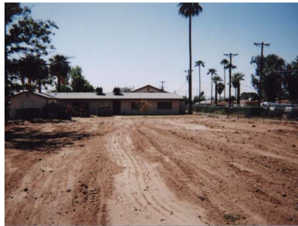
Vida Nueva - After