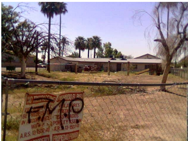
Vida Nueva - Before

The field located at the Vida Nueva church was overgrown with weeds, dead trees and had a playground equipment that was not only an eyesore, but had been in disrepair for several years. Workers at that site, including church parishioners, were fortunate to benefit from a probationer whose family had access and provided the use of a "Bobcat" backhoe. Mounds of dirt were leveled once the field was cleared of debris from the trees and playground equipment. Future plans include the preparation of the soil as well as installation of an irrigation system to start growth of plants and new neighbor relations.