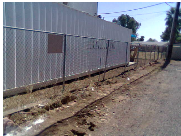
Lynnhaven - After

The field located at the Vida Nueva church was overgrown with weeds, dead trees and had a playground equipment that was not only an eyesore, but had been in disrepair for several years. Workers at that site, including church parishioners, were fortunate to benefit from a probationer whose family had access and provided the use of a "Bobcat" backhoe. Mounds of dirt were leveled once the field was cleared of debris from the trees and playground equipment. Future plans include the preparation of the soil as well as installation of an irrigation system to start growth of plants and new neighbor relations.