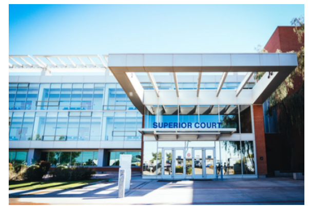
Juvenile Court Center - Durango 3131 West Durango Street Phoenix, AZ 85009-6292