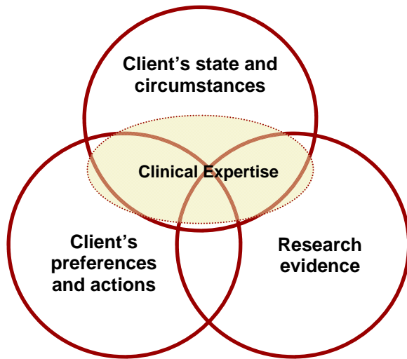
FIGURE 1: A model for evidence-based decisions (Gambrill, 2006)