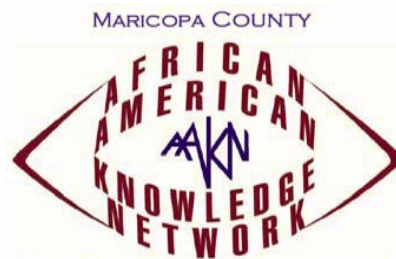
African American Knowledge Network