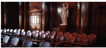
Rhode Island Supreme Court

(As of July 5, 2012, the defendants in the case were listed at the top of the Tax Division’s “Top 100” list of tax delinquents, with a total delinquency of more than $1.37 million.)