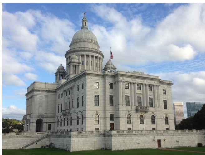
The Rhode Island State House, Providence, R.I.