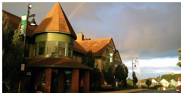
Newport County Campus: The seminar for tax preparers was held at the CCRI Newport County Campus (see photo above) in Newport on Friday, November 2, 2018, from 9:00 a.m. to 12:00 noon, in the main auditorium.