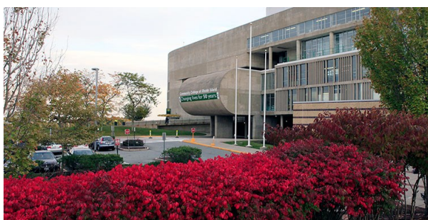
Knight Campus: The seminar for tax preparers was repeated at CCRI's Knight Campus (see photo above), in Warwick, on Friday, December 7, 2018, from 9:00 a.m. to 12:00 noon, in Presentation Room No. 4080.