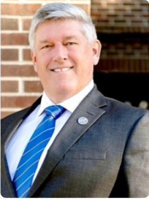
Troy Downing Commissioner of Securities and Insurance, Montana State Auditor Western Zone