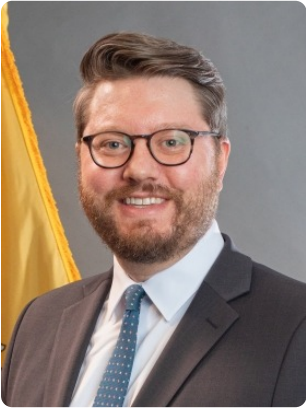
Justin Zimmerman Acting Commissioner Northeast Zone

Term of Office: At the Pleasure of the Governor Appointed: June 27, 2023