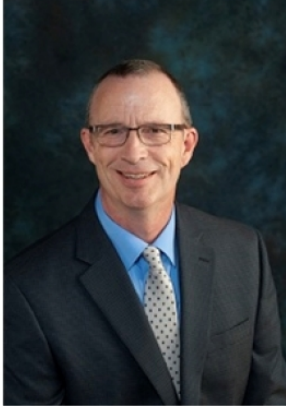
Jeff Rude Insurance Commissioner Western Zone

Jeffrey 'Jeff' Rude was appointed Insurance Commissioner of the Wyoming Department of Insurance by Governor Mark Gordon on September 19, 2019.