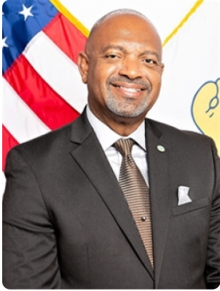
Tregenza A. Roach Lieutenant Governor/Commissioner Southeast Zone