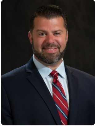
D.J. Bettencourt Commissioner Northeast Zone

David J. (D.J.) Bettencourt was confirmed Commissioner of the New Hampshire Insurance Department effective Sept. 20, 2023. Bettencourt assumed the position of Acting Commissioner, per New Hampshire's statute, after Commissioner Chris Nicolopoulos did not seek reappointment upon the conclusion of his term.