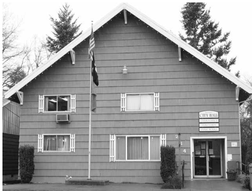
Napavine City Hall