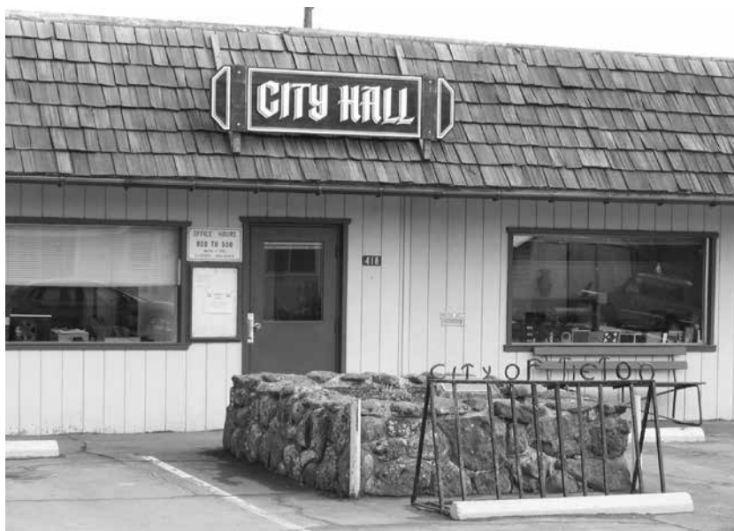
Tieton City Hall

Under the commission form of government, three elected commissioners function collectively as the city legislative body and individually as city department heads. Although one of the elected commissioners also has the title of mayor, he or she has essentially the same powers as the other commissioners.