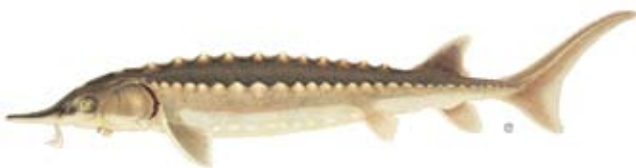
Shortnose Sturgeon ( Acipenser brevirostrum)

The Penobscot River Restoration Project: www.penobscotriver.org