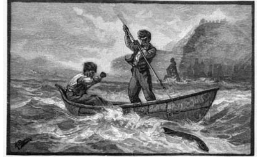
Spearing a porpoise. From Scribner's Monthly, Vol. XX, No. 6, October, 1880.