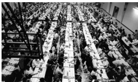
Super Bingo on the Penobscot Reservation, Indian Island, in 1983.

-Kirk Francis, Penobscot, Chief, Penobscot Indian Nation