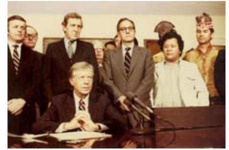
Signing the Maine Indian Claims Settlement Act, 1980.