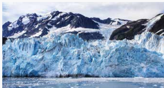
Prince William Sound, Alaska

Gear up with ice cleats for a guided exploration of Matanuska Glacier, Alaska's largest glacier accessible by road.