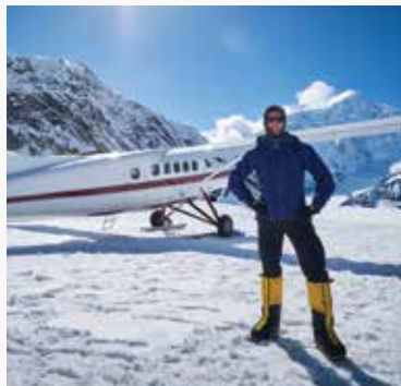
Ruth Glacier, Denali National Park

From Talkeetna, take to the skies for a stunning view of the Alaska Range and North America's tallest peak: Denali.