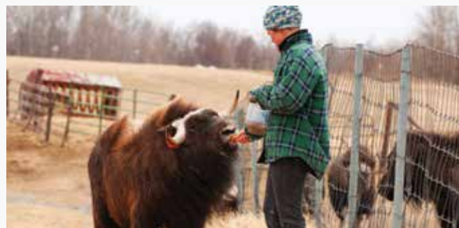
Musk Ox Farm, Palmer, Alaska

Travel to the port town of Whittier to embark on a small boat glacier cruise in the famed Prince William Sound, watching for abundant glaciers and marine wildlife.