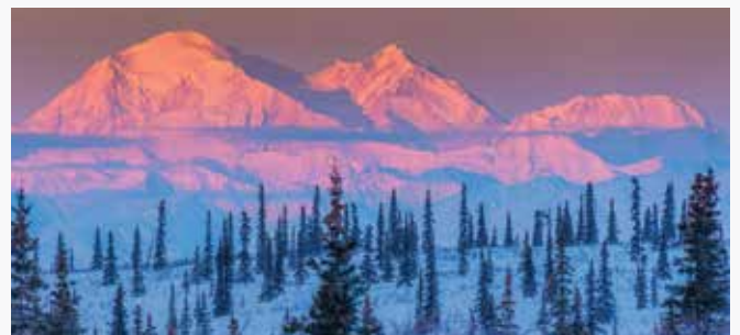
Denali National Park

Travel to the famed Denali National Park and Preserve on a guided day trip from Fairbanks. See page 12 for more details.