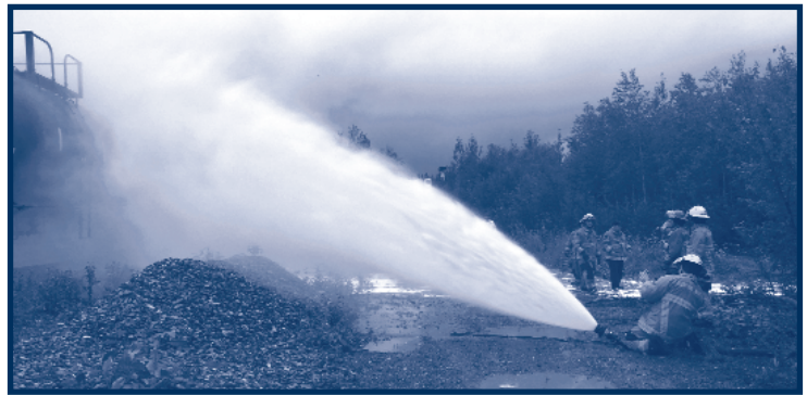
Mat-Su firefighters practice extinguishing a simulated fire on tank cars during a training drill at Pittman Siding north of Wasilla.