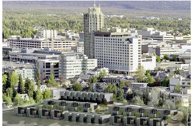
Above: The Downtown Edge Condominium Project in Anchorage's Ship Creek is one example of development that takes advantage of tourism opportunities in a growing market.

As Alaska grows, ARRC seeks to attract the kind of developers and business partners that will continue to improve our economy, our visitor industry, and our communities' quality of life.