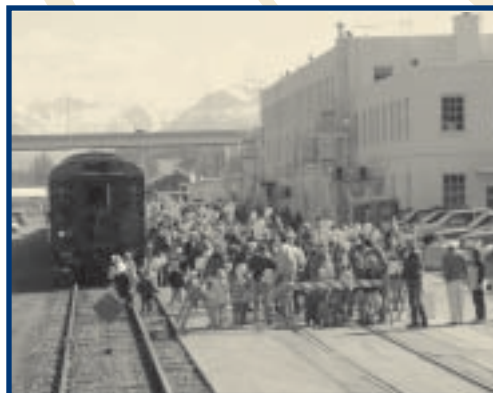
Above: Celebrating sunny skies and the promise of summer, the Alaska Railroad hosted about 7,000 residents in Anchorage and 2,000 in Fairbanks during annual open house events May 4 and May 11, respectively. Upper Right: Track rehabilitation and replacement is a consuming activity along the mainline as spring and summer weather afford maintenance crews ice-free access to the track. Lower Right: a new rail fan.