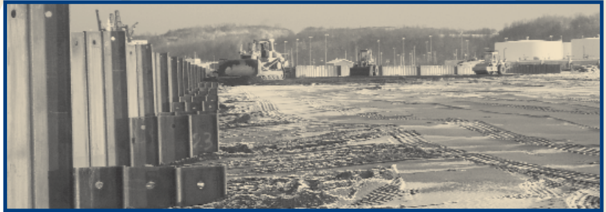
Williams Petroleum fills 8-1/2 acres of tidelands around its port facility.

Consequently, traffic at the two crossings often faced delays of