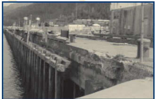
The Marginal Wharf was condemned in spring 2002 for safety reasons.