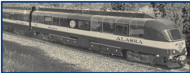
The DMU manufacturer hopes to interest ARRC in new passenger rail equipment, which is why they enhanced this image with Alaska Railroad colors and markings.

Known as a Diesel Multiple Unit (DMU), the new equipment is specifically designed to provide commuter rail service. Each DMU includes seating for 92, and is capable of pulling two to three additional single-level coaches at speeds of up to 70 mph. Colorado Railcar notes that it was the Alaska Railroad's early