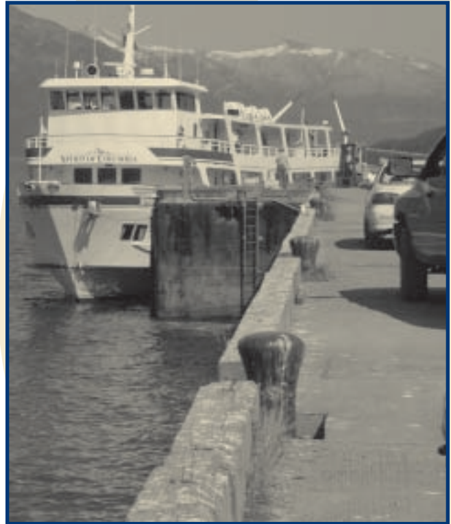
Cruise West's Spirit of Columbia moves to Delong Dock in summer 2003.