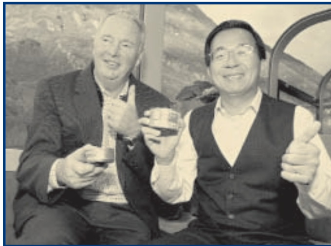
Governor Murkowski and Taiwan President Chen Shui-bian with salmon from an Alaskan business.

W hen Taiwan President Chen Shui-Bian stopped in Alaska November 5, on his way home from a trip to New York and Panama, Governor Murkowski had at his disposal all of the assets of the State of Alaska to showcase the state. He chose the Alaska Railroad to do this.