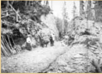
The privately owned Alaska Central Railroad under construction.