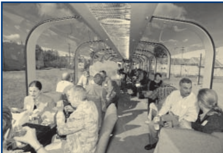
Government and civic leaders, and transportation planners from Anchorage and the Mat-su Valley took the DMU for a test ride between the Anchorage depots and Wasilla depot.