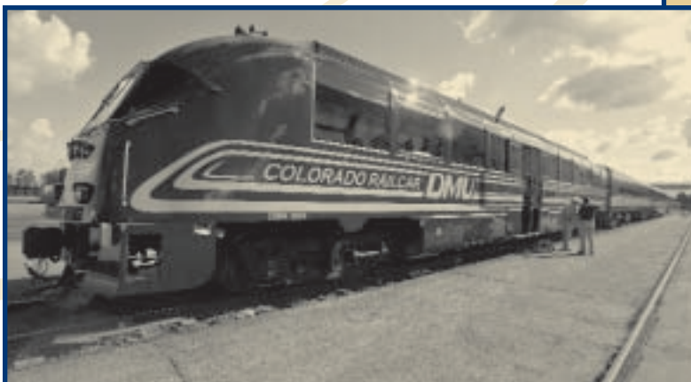
The premier DMU was on display for the public to view in communities along the railbelt.

The Alaska Railroad continues to coordinate with Anchorage and Mat-Su area local governments, whose support and involvement is critical to funding and establishing commuter rail service between Alaska's largest city and Alaska's fastest-growing communities in the Mat-Su Valley. ●