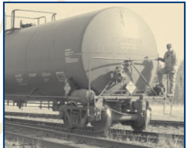
The railroad’s petroleum business soared in 2003.

The petroleum business soared, with a remarkable 795 million gallons of fuel (equivalent to 25,000-26,000 rail fuel cars) hauled from Fairbanks to Anchorage and other places along the railbelt. ●