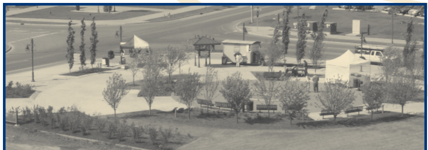
Vendors at the Ship Creek plaza offer food, arts and merchandise.

In the same vein, the railroad continues to support the Ship Creek Shuttle's summer operations by sponsoring additional Saturday service from Memorial Day to Labor Day. A daily shuttle schedule is available at www.alaskarailroad.com/community/shuttle_schedule.htm . ●