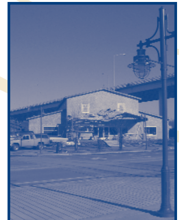
Above: An interpretive kiosk adds to the new pedestrian plaza. Right: The Ulu Factory builds a new facility across from the plaza.