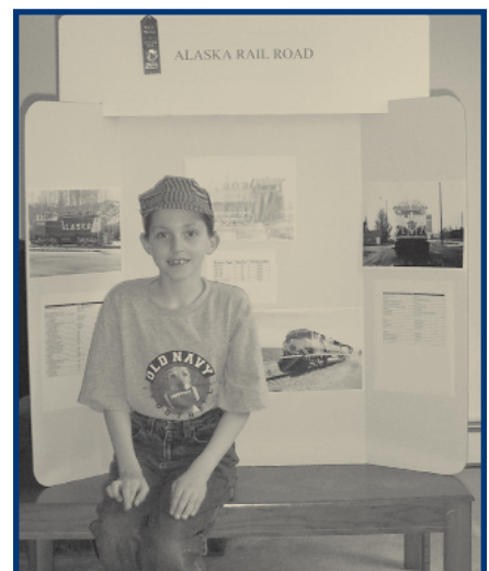
Fairbanks student’s rail-related science project wins a blue ribbon.

ARRC has worked with several railbelt schools to form School Business Partnerships through which railroad employee volunteers contribute to the educational experience by participating in, and supporting, school projects and functions. ARRC also partners with high school vocational institutions to train high school juniors and seniors as tour guides on the railroad. ●