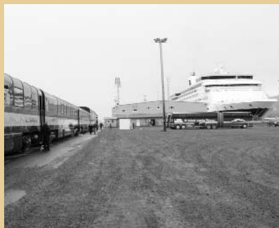
ARRC's dock in Seward provides new intermodal connections — from cruise ships to buses and trains headed for the Anchorage airport.

HB 267 authorizes ARRC to issue up to $17 billion in tax-exempt bonds for construction of a gas pipeline from the North Slope to the Lower 48. By using tax-exempt bonds, industry can shave more $1 billion off the cost. ●