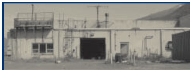
The new heavy equipment maintenance facility (top), replaces the old transit shed, which is being demolished.