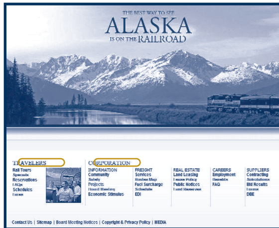
Alaska Railroad Portal to Traveler and Corporate sites.

Like the Travel site, the Corporate site has been updated with the latest information, and re-organized to be more intuitive. It is also re-designed to match the Travel site's modern look and feel. Together, the two sites offer better web-based tools and design to improve information delivery to the public. Both sites can be accessed via the common portal www.AlaskaRailroad.com .