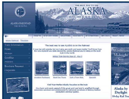
Alaska Railroad "Traveler" web site