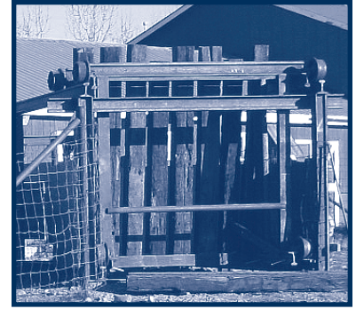
A baby musk ox and newly-fabricated crowder

The farm's mission is to domesticate musk ox to harvest its wool-like qiviut and to promote qiviut production as a sustainable agricultural practice in the far north. In so doing, musk ox must be combed each spring to obtain the qiviut. “By regularly running the animals through the barn, this process is made safe and stress-free for animals and handlers,” said Austin. The crowder is used at least weekly when all the animals are run through the barn to observe, monitor weight, administer maintenance (hoof trimming, vaccinations, veterinary care, etc.).