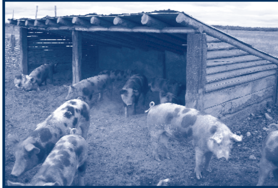
Donated railroad ties are used for the foundation and vertical supports on a pig shelter at the Point MacKenzie Correctional Facility farm.

The Alaska Railroad typically replaces tens of thousands of worn wooden ties along the main line each year. Some used ties are suitable for re-use on low-speed sidings and spurs, but thousands are sold to the public or donated to non-profits and agencies.