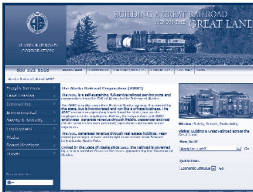
Alaska Railroad "Corporate" web site