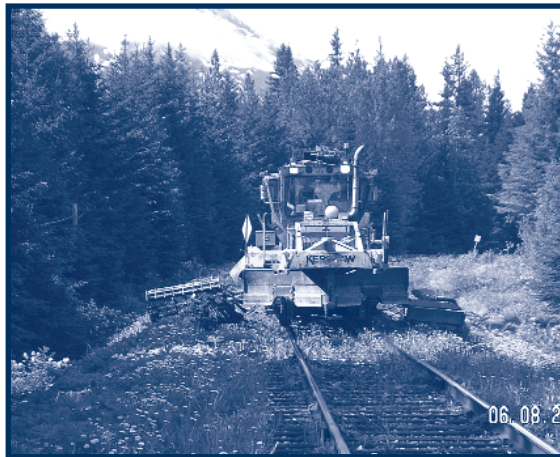
A ballast regulator was recently modified to include a rake attachment to help pull brush out of the track bed. It is about 20 miles north of Seward within the permit area.

“Persistent vegetation on and around the track structure presents a recognized safety risk. Plant roots growing under the tracks