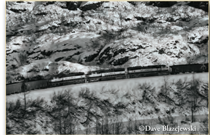
Using distributed power technology, ARRC now tackles Grandview Pass in just one run.

only saved labor costs and wear on rail and train equipment, it was also safer and faster. In the past, heavy, 67-car coal trains stopped at the base of Grandview Pass to divide into two segments that could make it over the relatively steep 3 percent grade with the power of three locomotives. Using distributed power technology, the railroad now employs seven locomotives, some inserted in the middle and end of the train, to tackle the pass in just one run. The trip is made in fewer than 12 hours now, saving crew costs while reducing the potential for accidents and injuries and boosting the profitability of each coal train. This innovation came at a particularly opportune time, as global market forces drove the price of coal up. The Alaska Railroad shipped more coal for export in 2010 than ever before – just short of one million metric tons. As a result, export coal revenue has grown markedly during the past two years, up more than 150 percent from 2008.