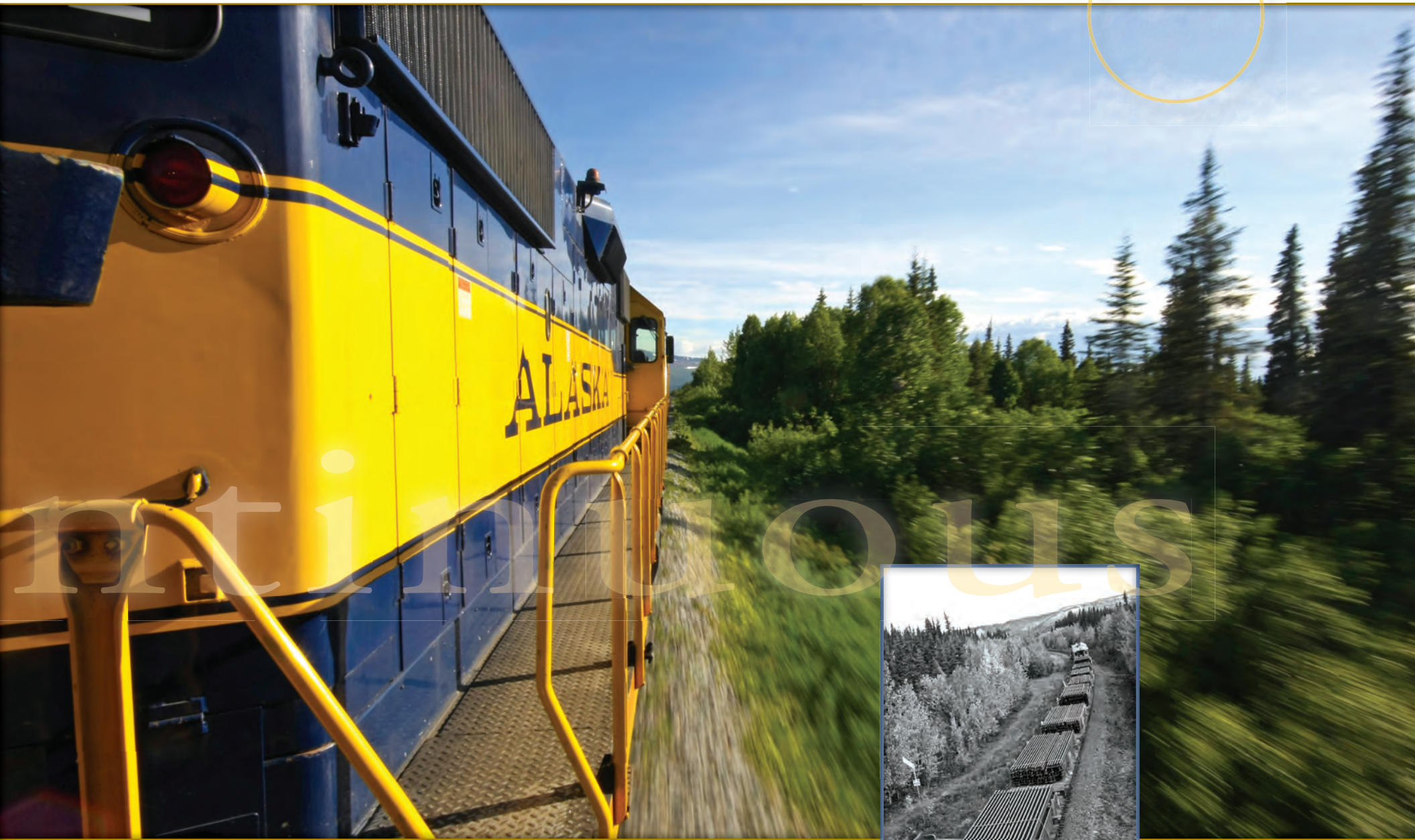
New rail on its way to Healy to be made into Continuously Welded Rail.