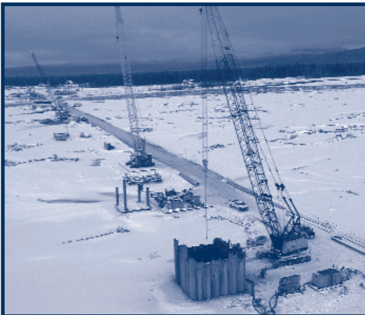
Work on the Tanana River Bridge piers continues in early winter.

(see "Year in Review and Outlook" on page 2)