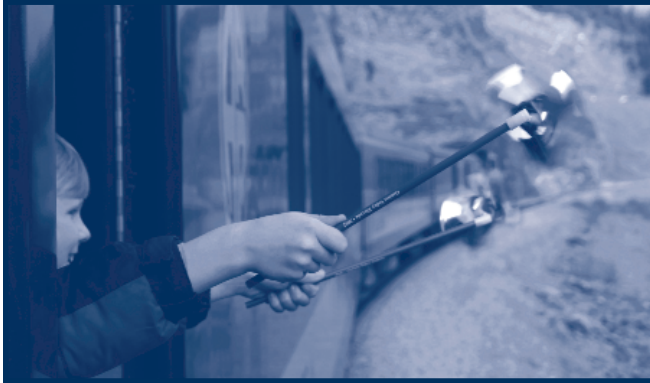
Healy kids play with GVEA windmills aboard the free train ride. (continued from page 2)

While the railroad seeks dialogue through public and committee forums, we also seek hands-on exchange. In January, we galvanized the interest and support of Alaska's rail fans by keeping a promise to bring Steam Engine 557 home to Alaska. The non-profit formed to oversee the historic locomotive's restoration has already recruited more than a dozen volunteers, including railroad customers, partners and employees. In October, we organized a small community open house in Healy. Similar to the large annual spring open house events in Fairbanks and Anchorage, the Healy event provided fun children's activities and free train rides to residents. It was combined with rail-related training for local emergency responders.