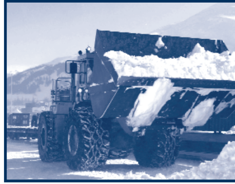
Crews in Whittier dig out from record snow-fall last winter.