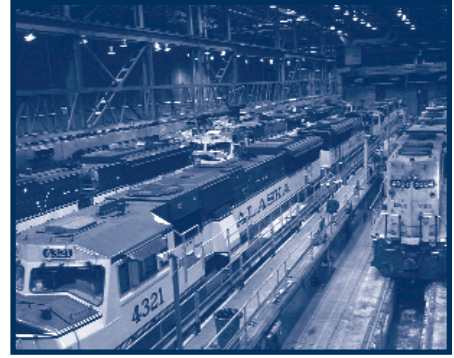
Locomotives are stored inside the railroad's diesel shop to reduce engine idling.

Such efficiency is important not only to the railroad, but also to our customers