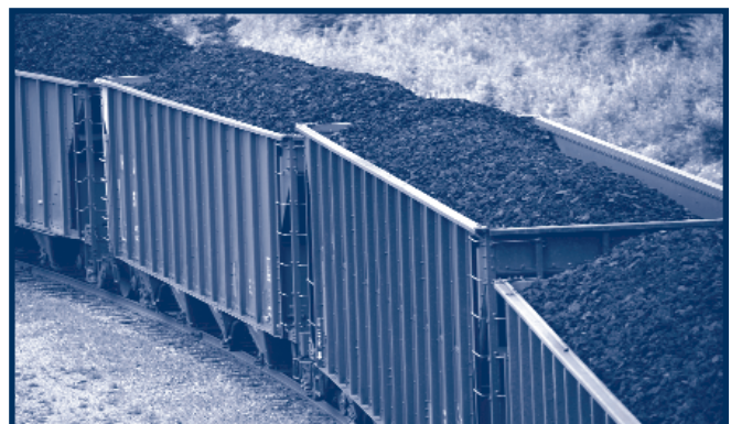
A fuel train loads at the North Pole Refinery and a coal train loads at the Healy Coal Mine. Petroleum and coal businesses have declined.