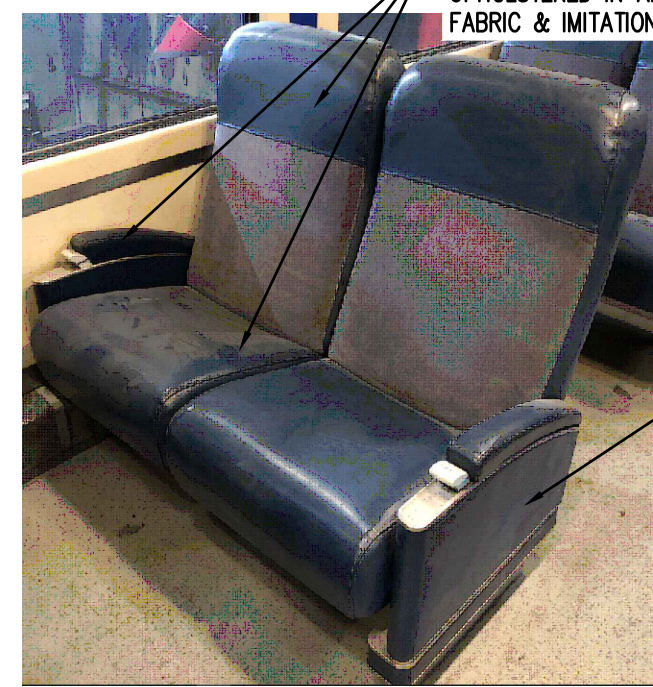
SEAT STYLE A

REMOVE EXISTING UPHOLSTERY, PROVIDE AND INSTALL NEW SEAT & BACK FOAM CUSHIONS UPHOLSTERED IN ARRC SUPPLIED FABRIC & IMITATION LEATHER.