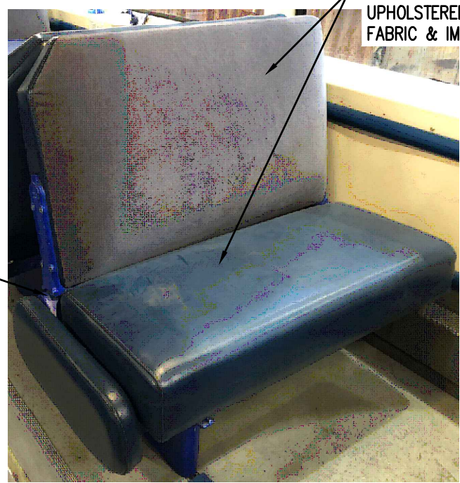
SEAT STYLE D

REMOVE EXISTING UPHOLSTERY, PROVIDE AND INSTALL NEW SEAT & BACK FOAM CUSHIONS UPHOLSTERED IN ARRC SUPPLIED FABRIC & IMITATION LEATHER.