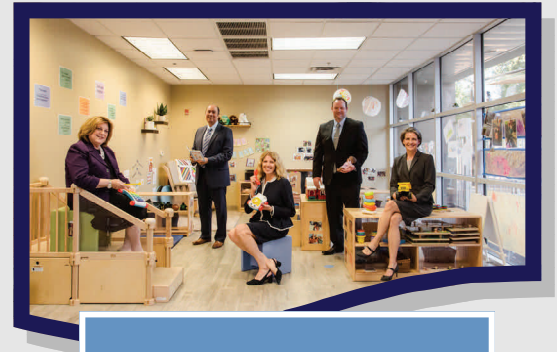
Child Crisis Arizona

Into its fifth decade, CCA continues to actualize its doctrine of “Safe kids. Strong families.” The merging of emergency shelter services and preventative measures allows CCA to not only support victims during the most strenuous times, but to also pursue a world with fewer victims. CCA’s team focuses on child abuse prevention, intervention, and early childhood education. Their prevention programs equip parents with the knowledge and skills to properly care for youth. CCA’s intervention services consist of an emergency children’s shelter, a group home, counseling services, and foster care and adoption programs. CCA goes beyond providing a service by putting an emphasis on each individual child’s needs and working on ways to achieve long-term results. When the Arizona Department of Child Safety removes a child from the home, CCA becomes a safe home away from home for the child in distress and addresses all needs they may have as a result of their trauma. In addition, they also enroll children in school and provide them with tutoring to regain normalcy in their lives. Their approach in facilitating victim healing has helped over 35,000 children. CCA demonstrates their extraordinary care for the well-being of victims and perseverance in their lives as a symbol of acceptance, recovery, and home.