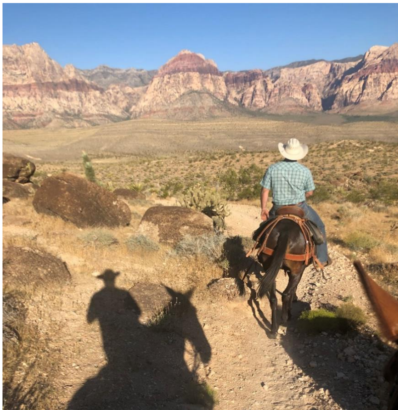
Visitors enjoying the views on horseback

This year, Red Rock Canyon staff added more counters at social access points into the Red Rock Canyon, to improve the accuracy of our data collection and understanding of visitation. The Red Rock Canyon field staff plans to install additional counters in the coming year to continue to improve our tracking of visitation especially on the more popular trails. The visitation differs in the varying parts of Red Rock Canyon: In the north (Harris Spring) we have mostly OHV users; in the South (Cottonwood Valley) mountain bikers and climbers are our main users; the western section, which is our wildland urban Interface, hikers and mountain bikers are dominant throughout; Calico Basins is primarily used by hikers and climbers; our scenic drive gets mostly national and international visitors that rely on our main roads and well-established hiking trails; climbers access our world-renowned climbing routes from the scenic drive; equestrian use is spread throughout the NCA with the exception of our scenic loop drive/core area.