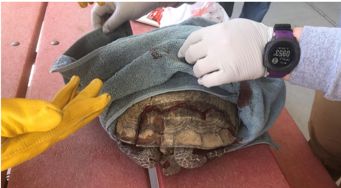
An injured endangered Desert Tortoise being cared for by Park Ranger at Red Rock Canyon