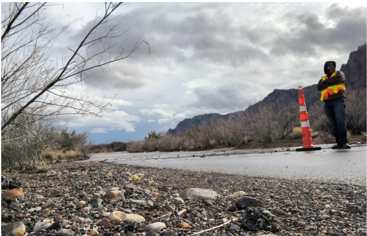
Scenic Loop Closure due to flooding

Last year Red Rock Canyon had multiple extreme weather events including snow, ice and heavy precipitation. We had to close our scenic drive (either all day or part of the day) 5% of the time. The year prior we had 224 days without precipitation.