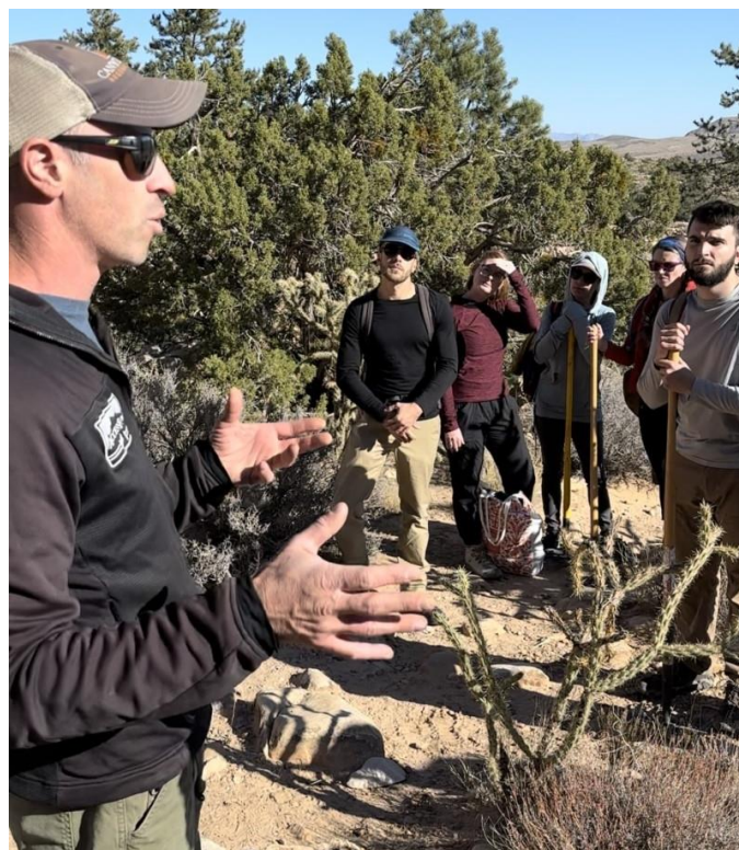
Instructing Trail Repair Crew

Red Rock Canyon participated in the Teachers on Public Lands program. Our volunteer teacher developed curriculum for in-class and environmental education for grades K–5. The Red Rock Canyon team also expanded their outreach efforts with the Women in Science Speaker Series hosted in collaboration with our onsite partners, Friends of Red Rock Canyon and Southern Nevada Conservancy.