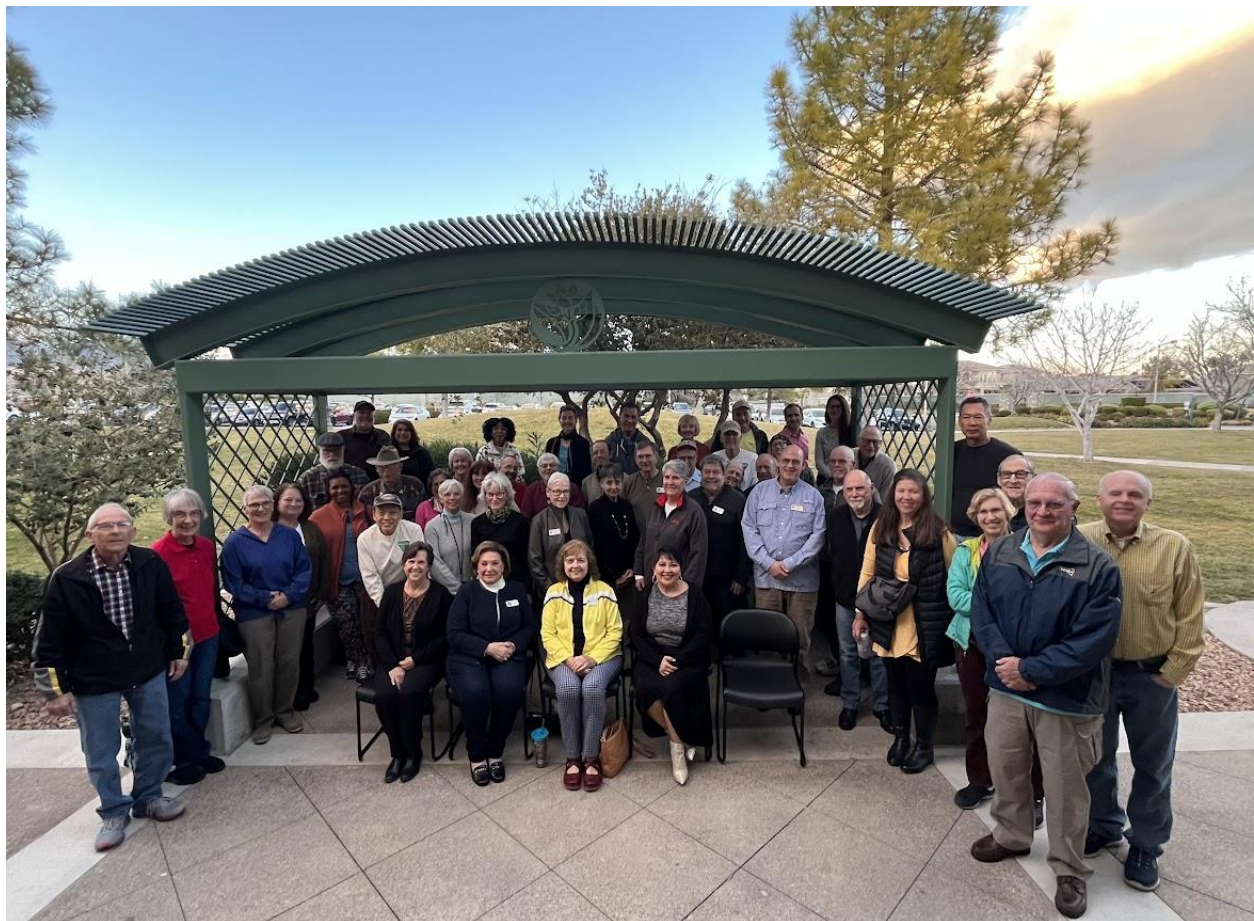
Friends of Red Rock Canyon volunteers at our Volunteer Appreciation event

Southern Nevada Conservancy also operates our Fee Booth and the bookstore in the Visitor Center. Other partners include the Southern Nevada Climbing Coalition and the Backcountry Horsemen. We are currently working with these two groups on a Memorandum of Agreement.