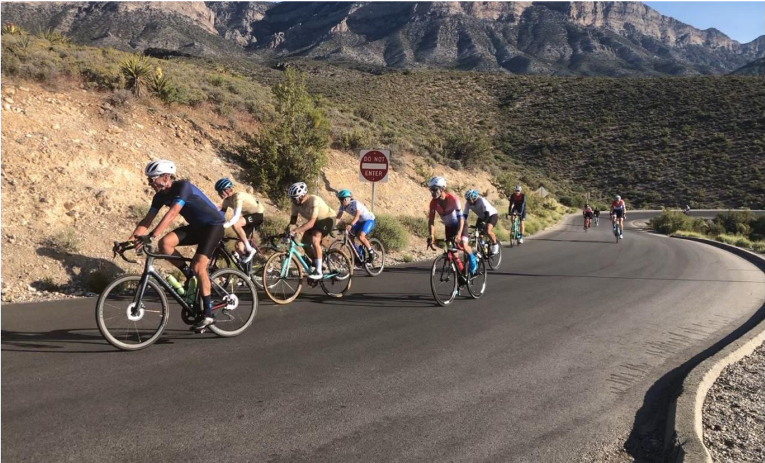
Amateur bicycle race on the Red Rock Canyon NCA Scenic Drive

In addition, Red Rock Canyon began a program for corporate volunteer events. There has been a desire by many corporations that are either based in Las Vegas or that come to conventions to Las Vegas to provide their employees the opportunity to give back to nature. While the program only started in 2023, the requests for these types of events in the current fiscal year has already more than quadrupled, requiring us to dedicate a full-time staff member to organize these corporate volunteer events.