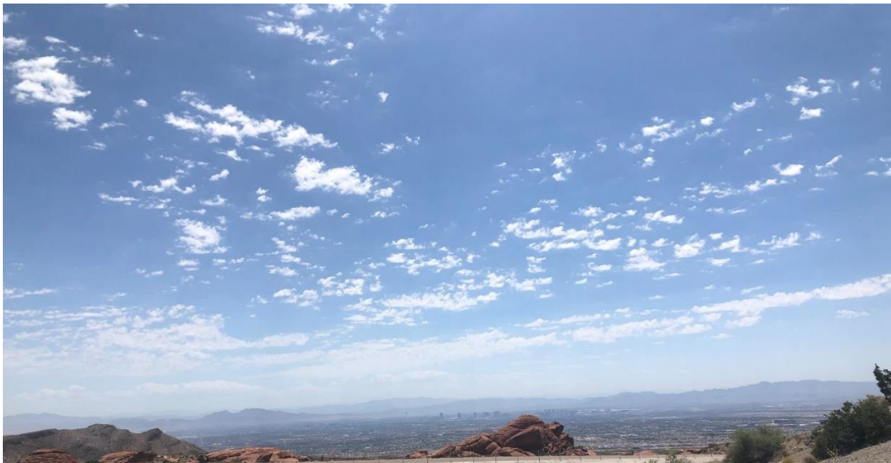
View of Las Vegas from the NCA boundary

Other issues include the temporary closure of the Administration Building at Red Rock Canyon, due to aging, resource affects, and normal wear and tear. A start date for the repair of the building is to be determined. Currently, Red Rock Canyon park rangers have been working out of the classroom in the Visitor Center, while resource staff and outdoor recreation planners have been primarily teleworking. The staff at Red Rock Canyon is doing an amazing job but with the limited space and resources we have it is very challenging to manage the most visited National Conservation Area in the BLM. Some National Park Service units with similar visitation as Red Rock Canyon have two to three times more staff. In addition, the cost of living in the local community is 9% higher than the national average, and housing prices are 40% higher than the national average. Nevada also has the highest childcare costs in the nation. These economic factors have impacted employee recruiting.