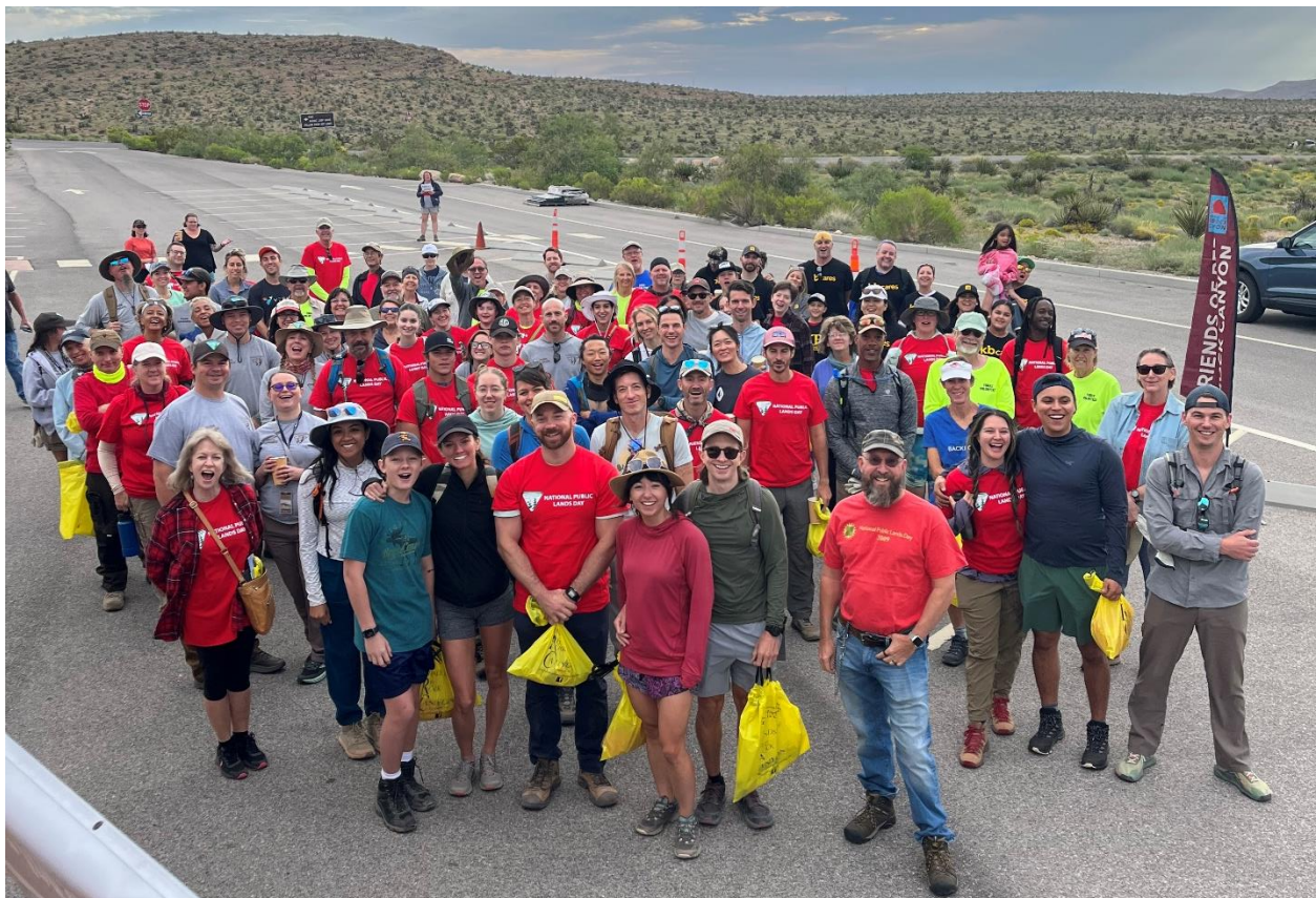
A diverse group of volunteers at National Public Lands Day event in Red Rock Canyon

Red Rock Canyon is part of the ancestral lands of more than eleven local Tribes. In 2023, the BLM continued monthly Government-to-Government consultation with the Moapa Band of Paiutes and monthly informal coordination meetings with the Twenty-Nine Palms Band of Mission Indians. Continued consultation and coordination, especially on major projects, is a priority and vital to the successful management of Red Rock Canyon. Additionally, Red Rock Canyon embarked on a new cultural ethnography project to understand the history of the NCA more completely.