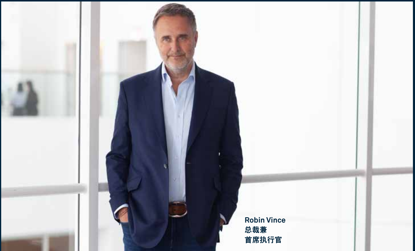
Robin Vince 总裁兼 首席执行官

去年是我担任 BNY Mellon 首席执行官的第一年。我很荣幸能够领导这家拥有辉煌的历史、令人羡慕的特许经营权，并且在世界资本市场处于中心地位的公司。