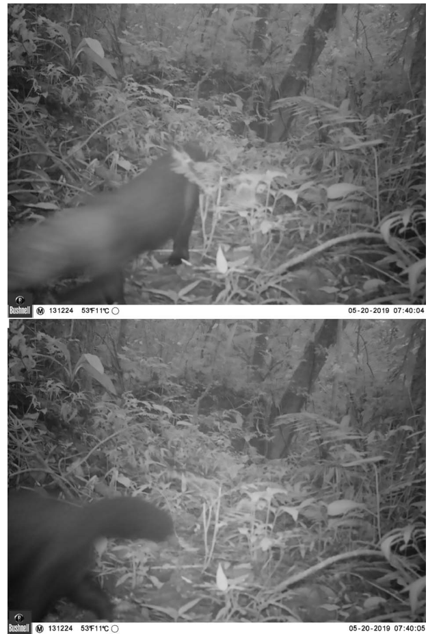
PLATE 1 The two camera-trap photographs of the bush dog Speothos veneticus obtained on 20 May 2019 in the municipality of Santa Rita do Sapucaí, in the state of Minas Gerais, Brazil (Fig. 1).

Ethical standards This research followed ethical procedures for conducting camera-trapping (Sharma et al., 2020), the cameras only recorded photographs of wildlife, and this research otherwise abided by the Oryx guidelines on ethical standards.