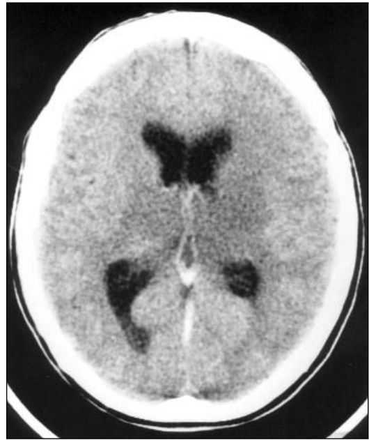
Figure 1: Noncontrast axial CT scan from a patient with deep cerebral venous thrombosis. Note the bilateral hypodensities in the thalami and left corona radiata, and increased density in the internal cerebral veins and vein of Galen.

Compared to dural sinus thrombosis, DCVT is rare (nine out of 135 cases in the largest series of CVT), has a higher mortality, and is more likely to present acutely with impaired conscious-