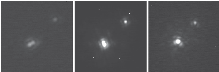
Figure 1. (top) Epoch 05 May 2012 VLBI image of the binary HII 2147 system. Both components are clearly detected. The projected separation between the binary components is 50 mas or roughly 6 AU. (bottom) Three epochs of Keck II /NIRC2-NGSAO imaging of HII 3197. The system is resolved into a triple and significant orbital motion of the close pair is seen from 2006 (left) to 2011 (middle) and 2012 (right). North is up and East is left in each image. The separation between the close pair and the tertiary is \approx 0.6'' .