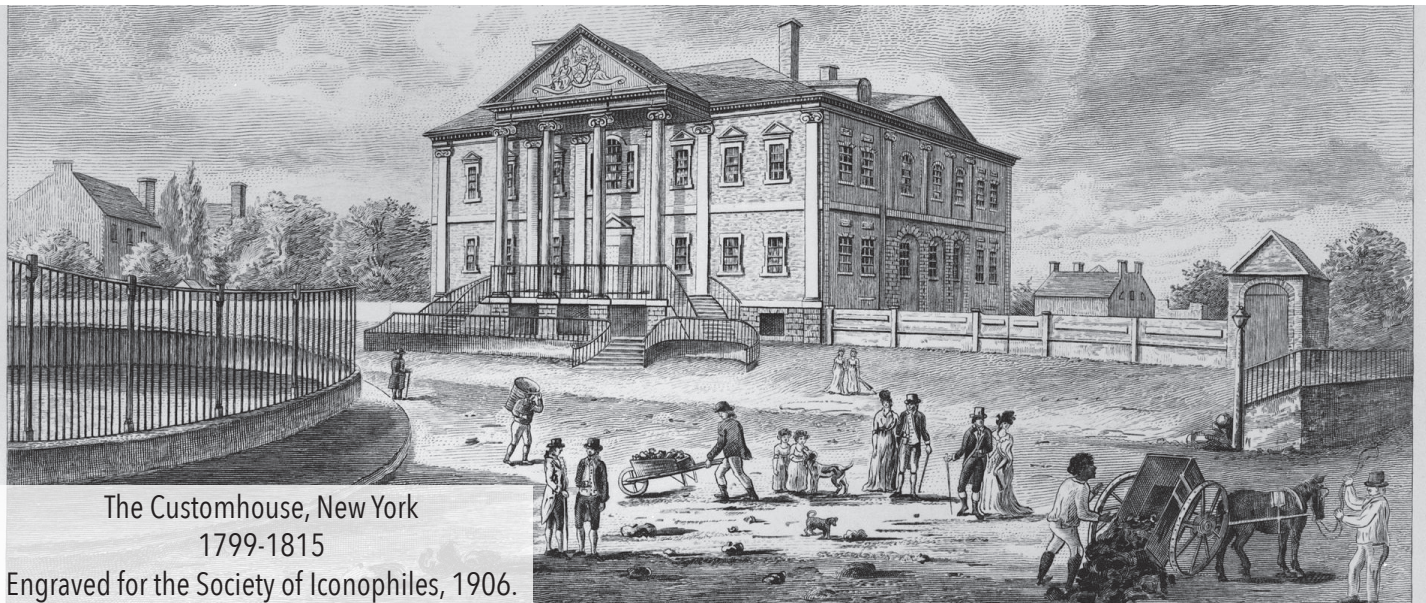
The Customhouse, New York 1799-1815 Engraved for the Society of Iconophiles, 1906.

It also helps drive the nation's economic engine by facilitating lawful international trade and travel through the enforcement of hundreds of U.S. laws and regulations ranging from agriculture to intellectual property rights.