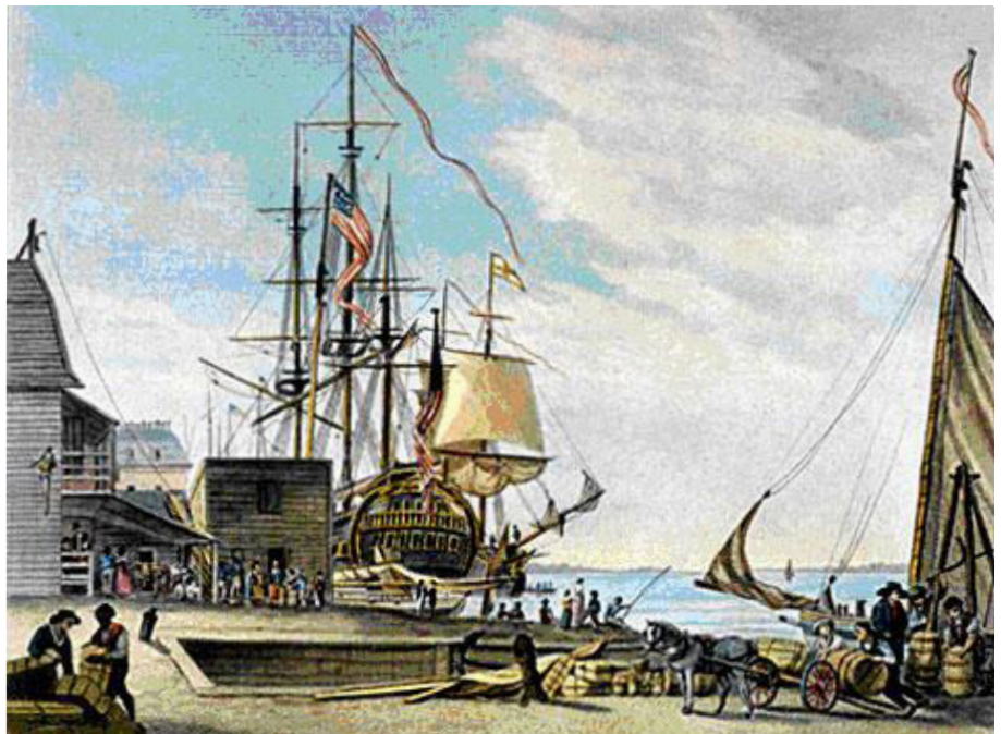
"Arch Street Landing" in Philadelphia. Engraving by W. Birch, dated 1800. In the early years of the nation, the port of Philadelphia was the largest in the nation.