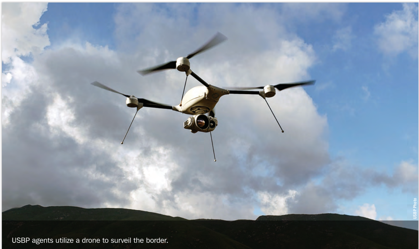
USBP agents utilize a drone to surveil the border.

The amount of information the USBP generates and the additional information we have access to has transformed our data into a strategic asset. The capture, storage, organization, and dissemination of quality data is paramount to making informed decisions about field operations, acquisitions, and system performance. Governance standards and knowledge management create an environment where information sharing improves and analytic capabilities become more efficient and effective. For those areas where we cannot answer complex questions organically, the USBP will leverage partnerships with universities and other research communities to help tackle the complicated and complex problems surrounding the delivery of effective border security. ■