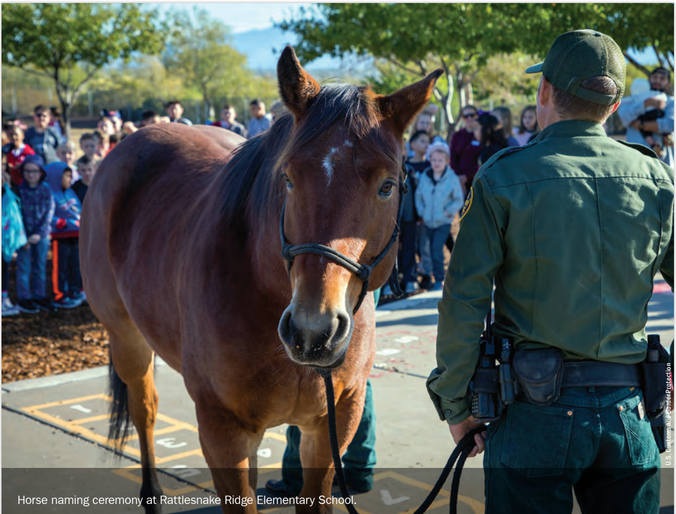
Horse naming ceremony at Rattlesnake Ridge Elementary School.

T he USBP recognizes that transparency and open communication with employees, stakeholders, citizens, and partners is invaluable. Direct engagement results in increased trust and credibility, generates feedback, informs operations, and improves desired outcomes. We will strengthen our communications using the most current and emerging technologies to disseminate relevant and timely information, while recognizing that circumstances dictate which method to use.