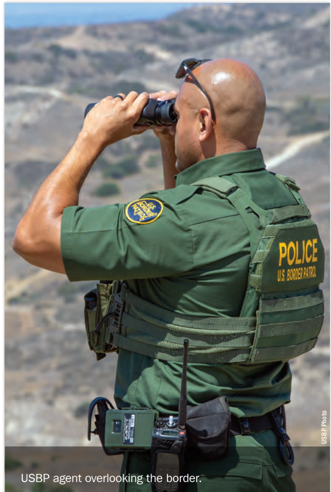
USBP agent overlooking the border.

This strategy includes three distinct, but interrelated, lines of effort to achieve the operational goals. First, our focus is to anticipate, detect, and identify the various threats we face across our unique Areas of Responsibility (AORs) to mobilize our response capabilities, engage our partnership capacity, and effectively employ our operational investments. Our understanding must not be limited to perceived cross-border threats, but also the political, socioeconomic, climate, and other environmental and cultural factors which drive criminal activity. With this requisite understanding, we can seek to influence the operating environment, thus limiting the options and freedom to act of organizations facilitating illicit cross-border activity. Finally, as a result of that understanding, and with our partners in the border security enterprise, the USBP can curb human, narcotics, and other illicit trafficking using our enhanced understanding and informed operational posture.