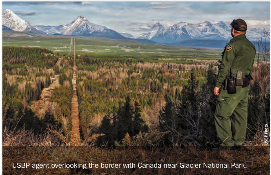
USBP agent overlooking the border with Canada near Glacier National Park.