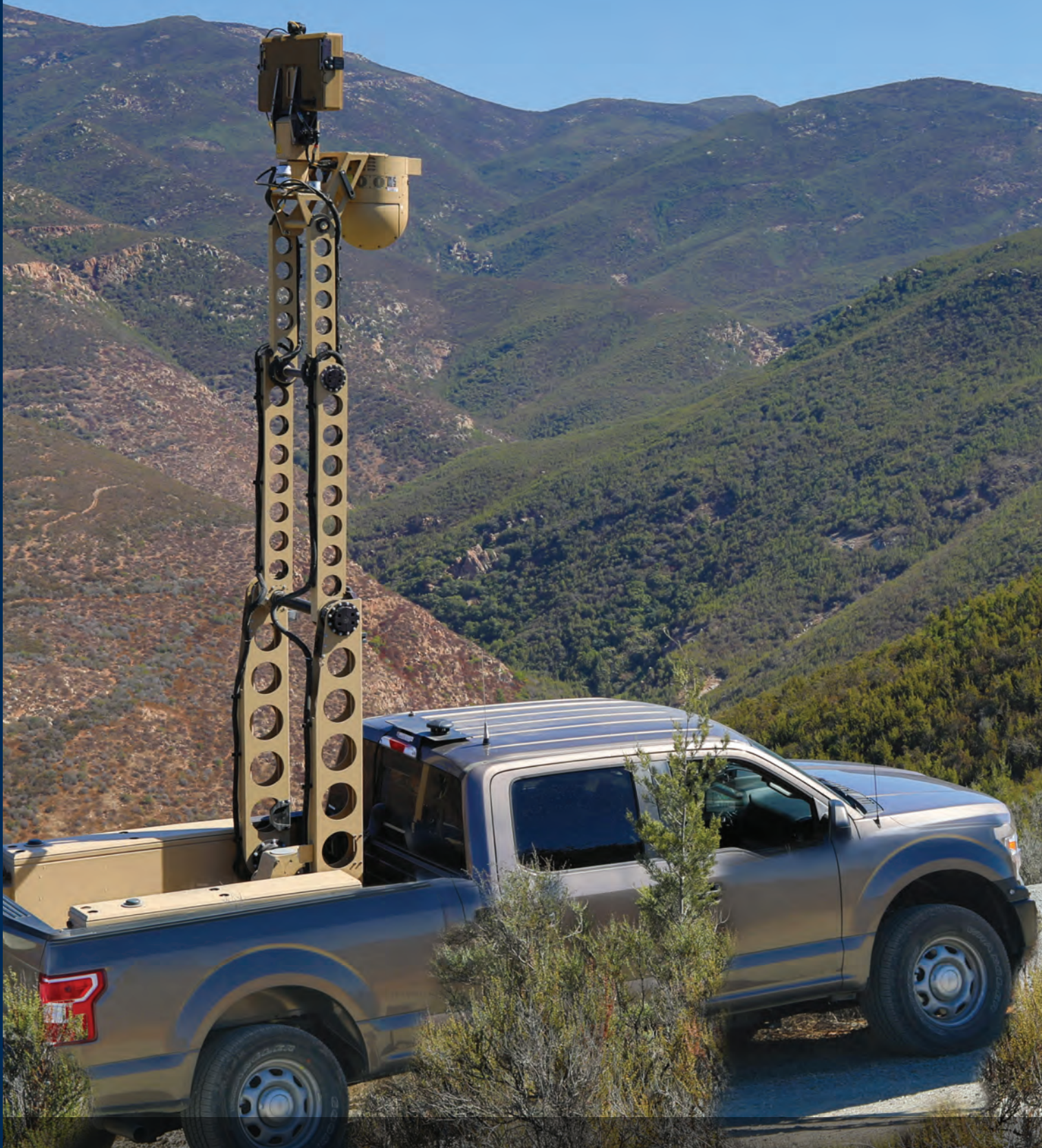
USBP agent utilizing mobile surveillance technology.