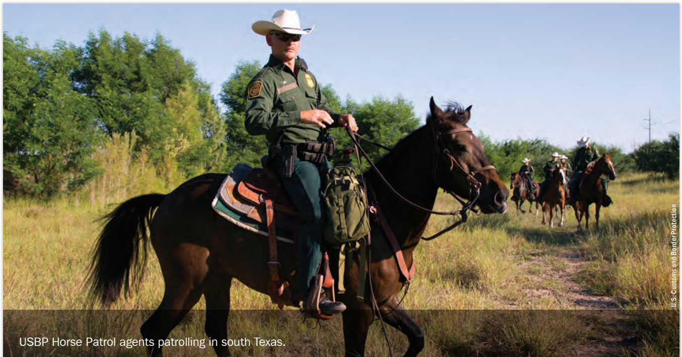
USBP Horse Patrol agents patrolling in south Texas.