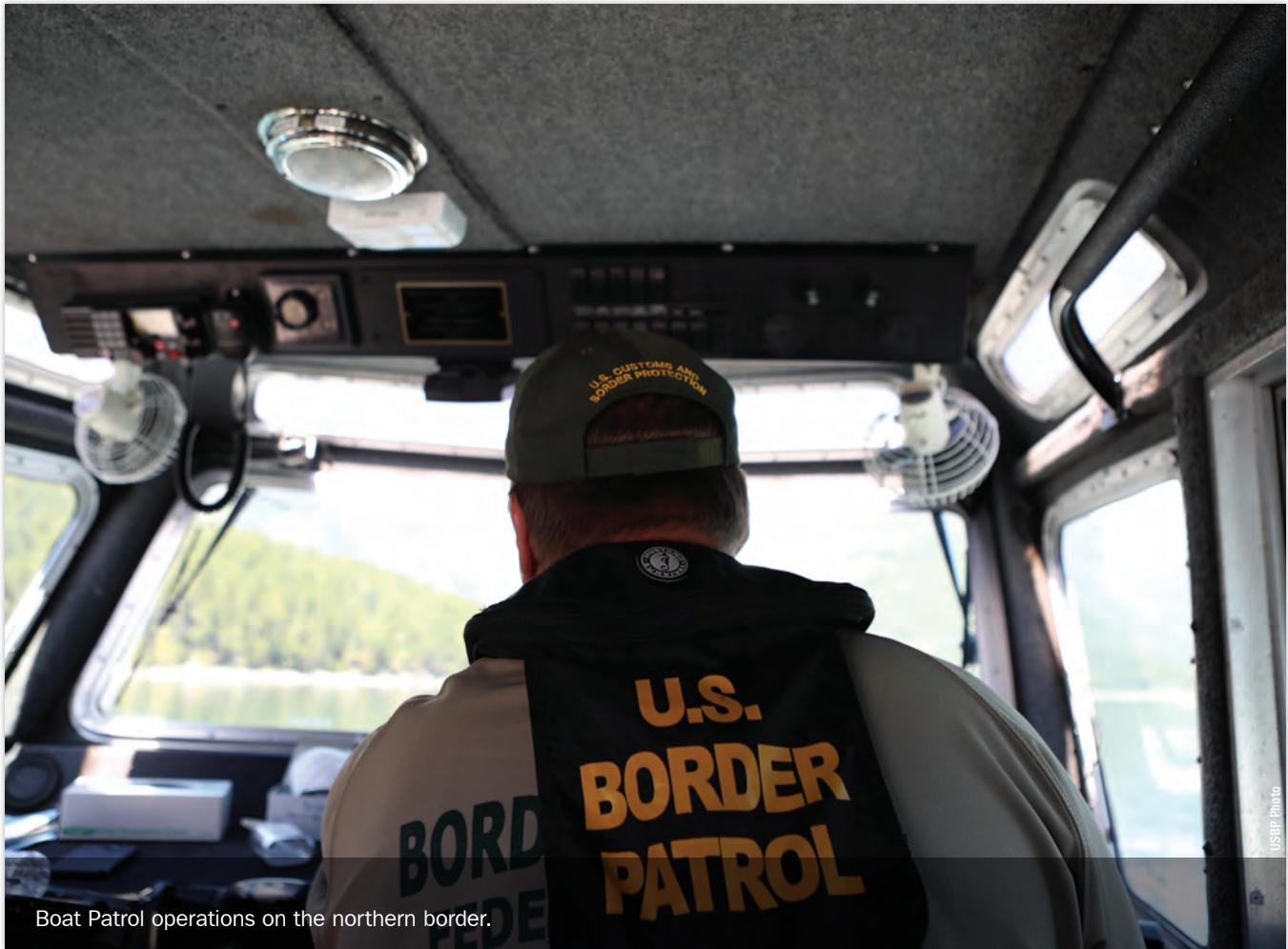
Boat Patrol operations on the northern border.