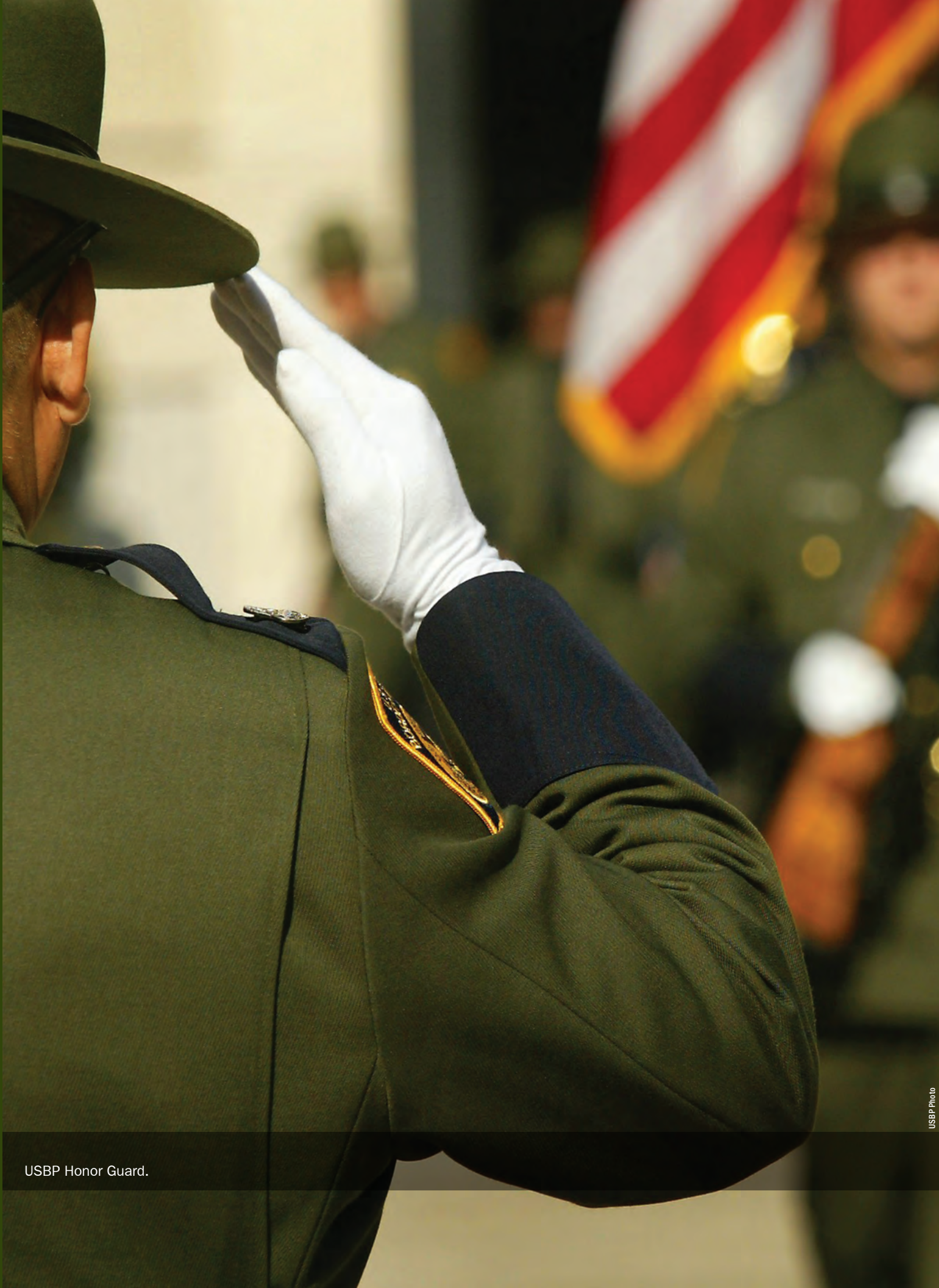
USBP Honor Guard.