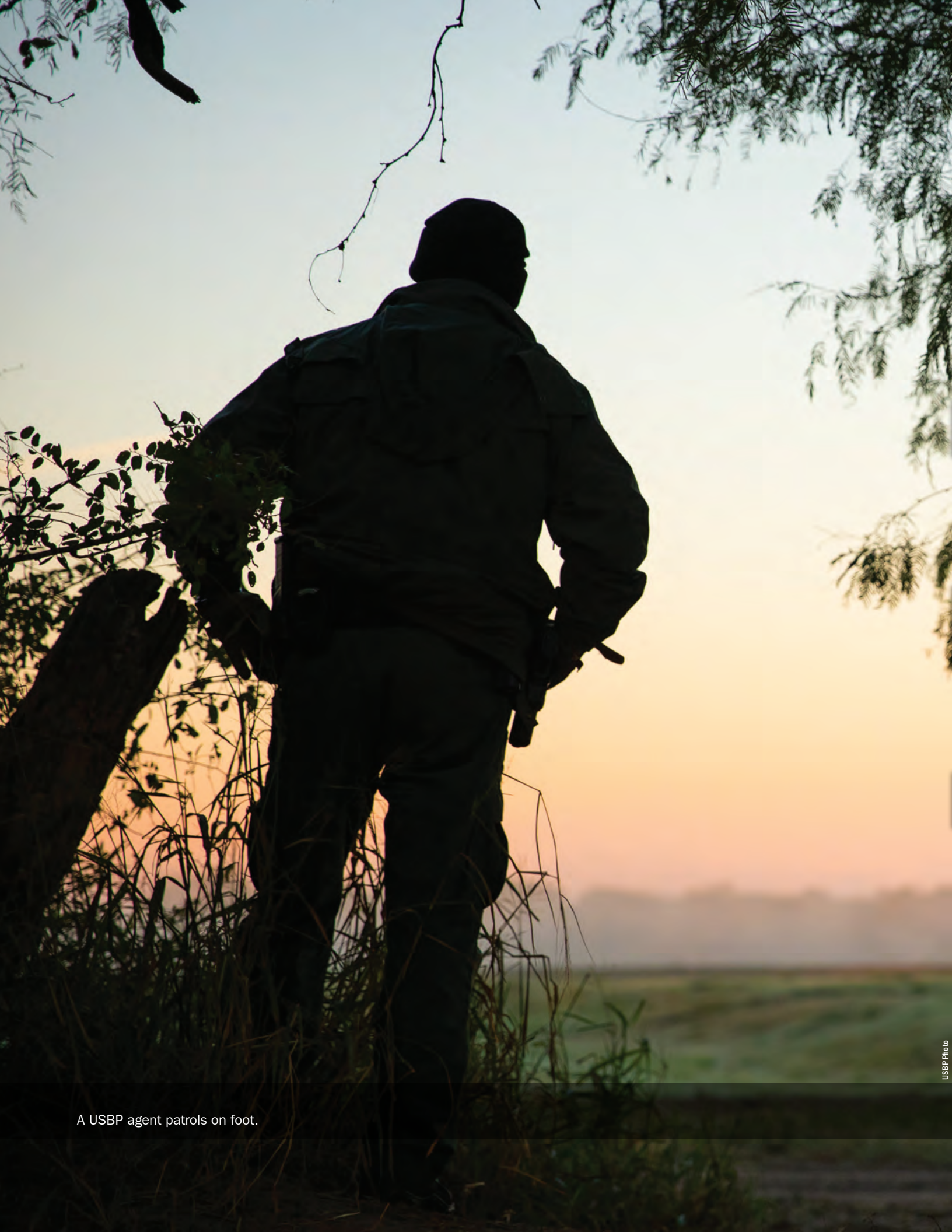
A USBP agent patrols on foot.