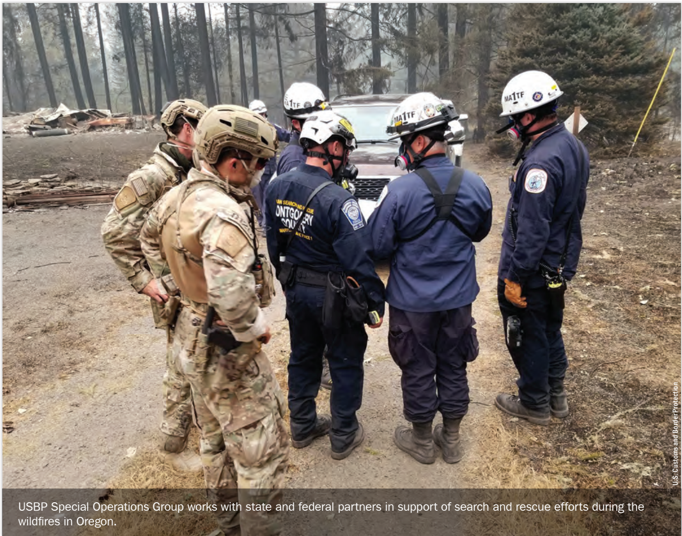
U.S. Customs and Border Protection