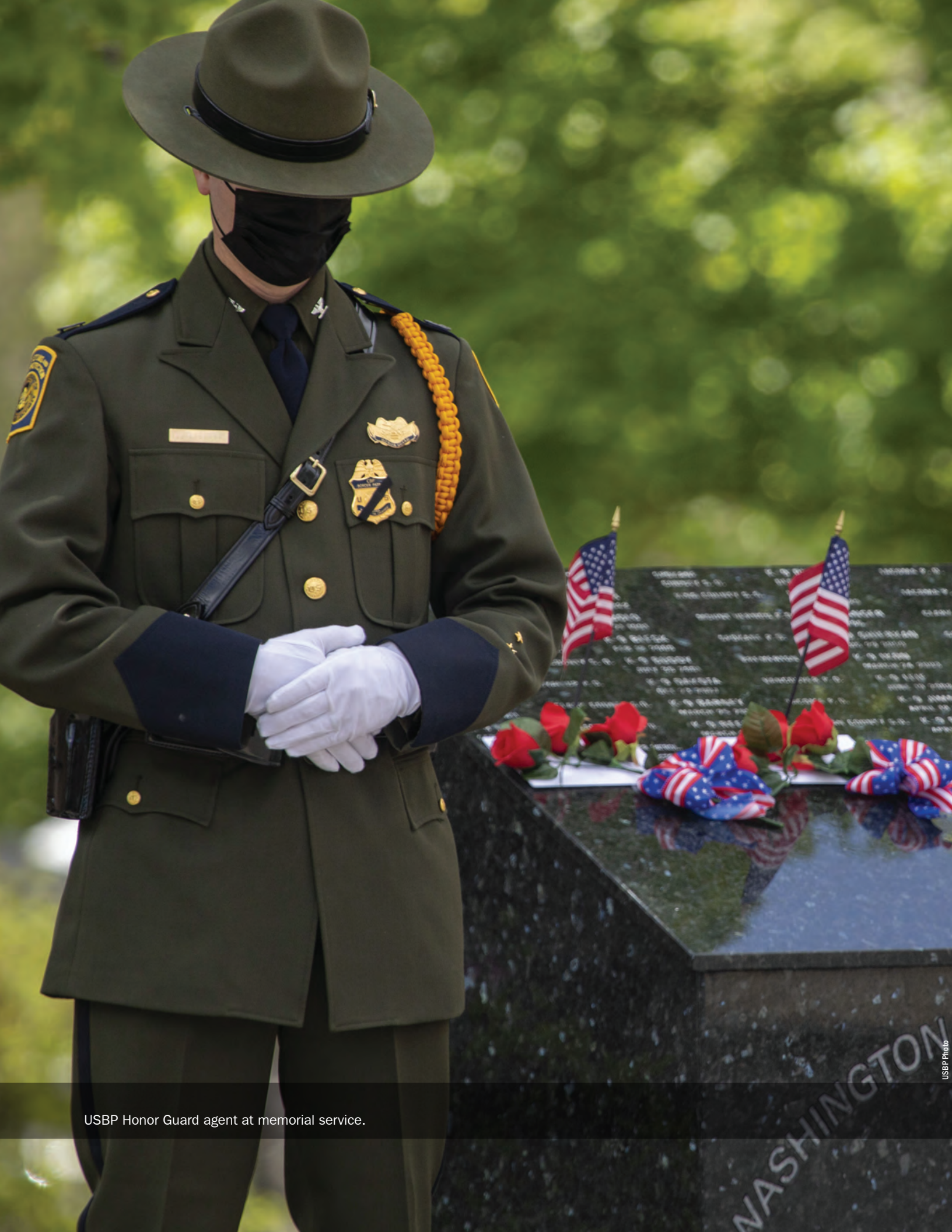
USBP Honor Guard agent at memorial service.