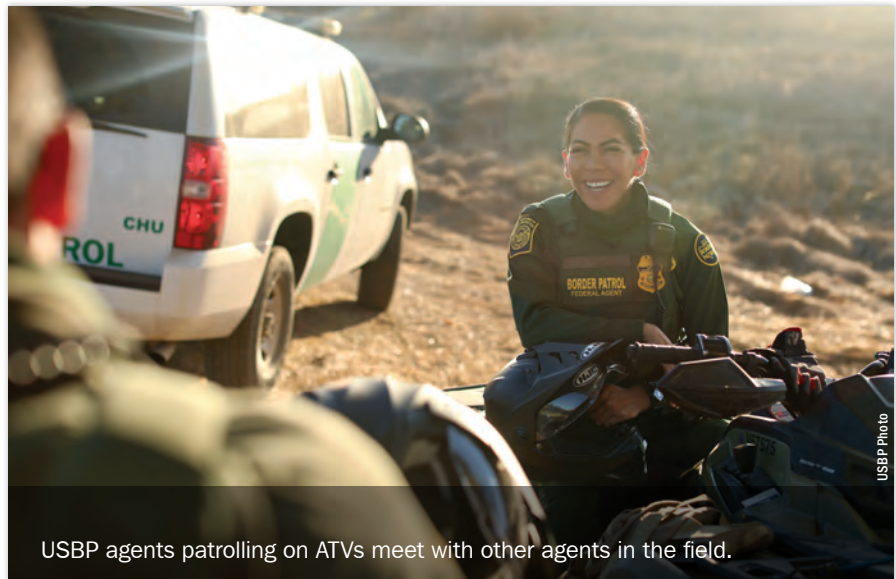
USBP agents patrolling on ATVs meet with other agents in the field.

The USBP will seek to fill its ranks with a diverse, professional workforce that is prepared to serve. Establishing new and innovative ways to expand the hiring pipeline is key to this effort. There is no one source for qualified BPAs, and because of the vast areas of the U.S. where there is no USBP presence, we must seek out and recruit applicants where they live. Once we have hired quality people, we must support them in their day-to-day lives, professionally and personally. The USBP will continue to invest in resiliency programs and identify and pursue other work-life balance programs. We will also continue to expand opportunities for workforce