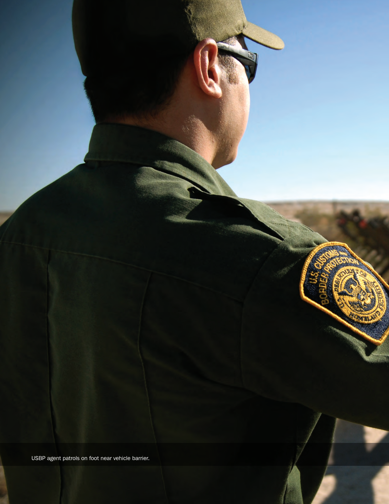
USBP agent patrols on foot near vehicle barrier.