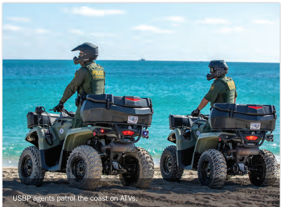
USBP agents patrol the coast on ATVs.