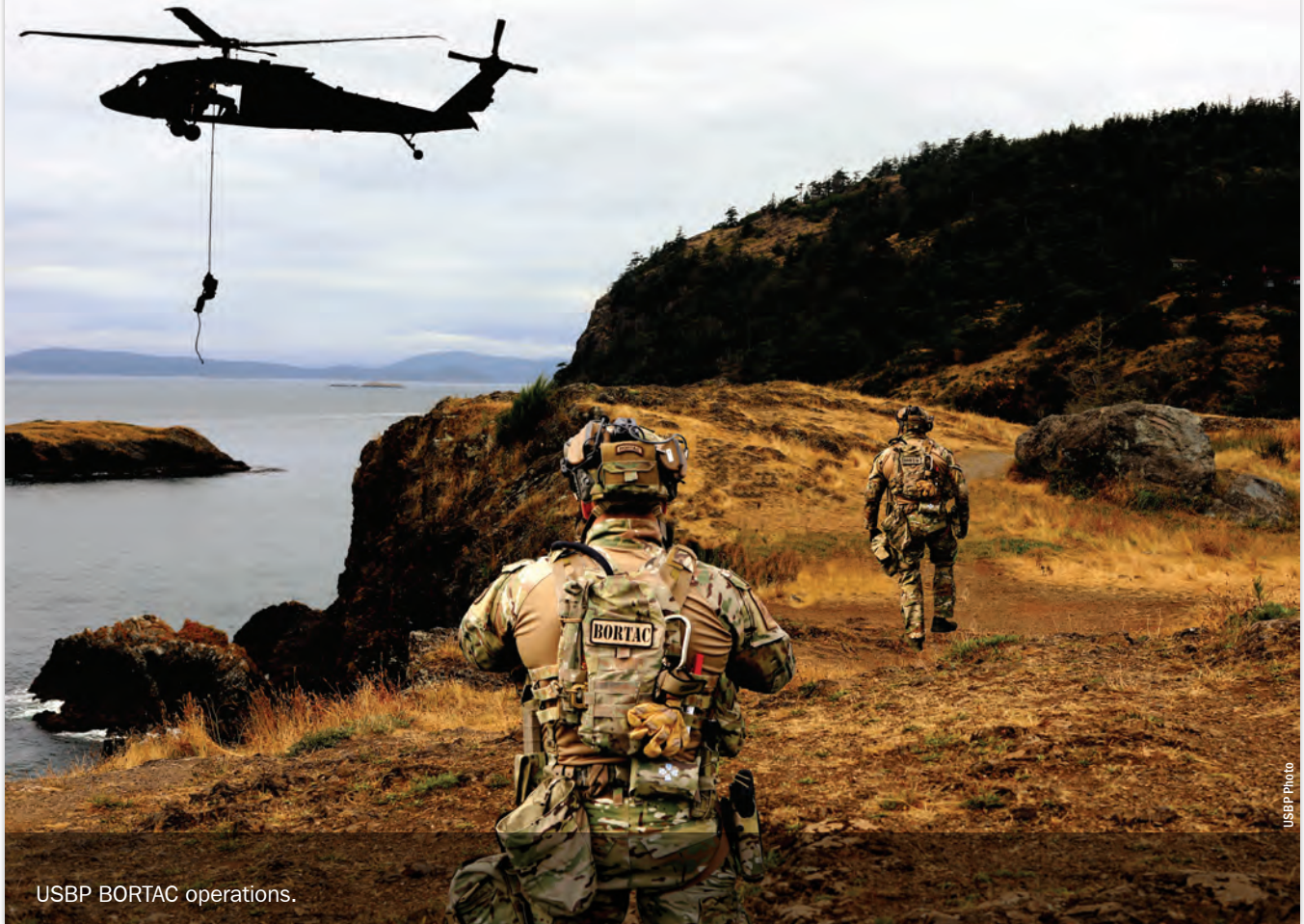
USBP BORTAC operations.