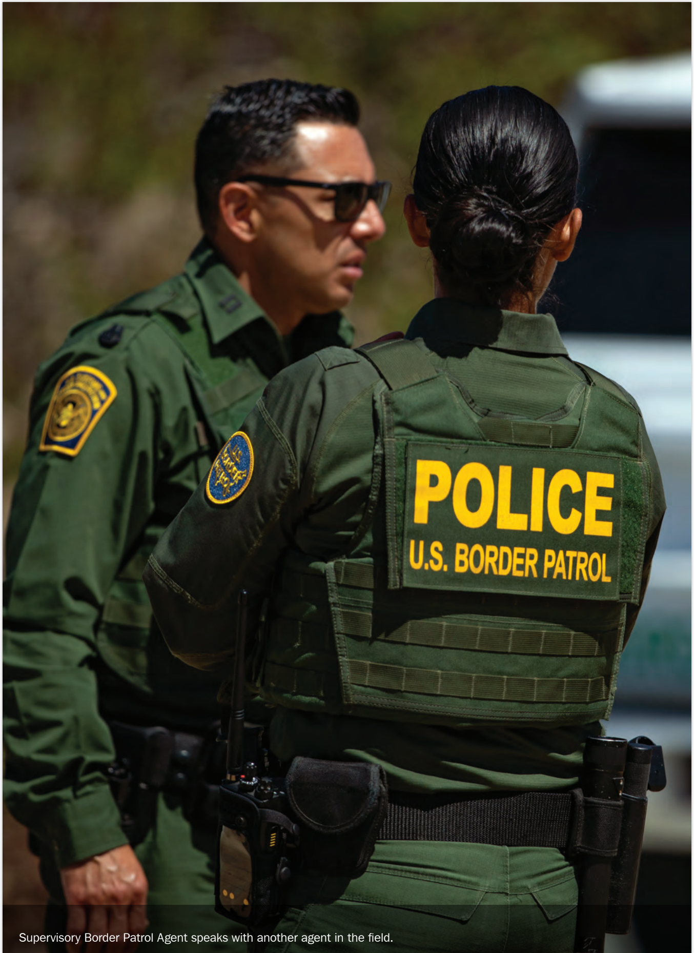
Supervisory Border Patrol Agent speaks with another agent in the field.