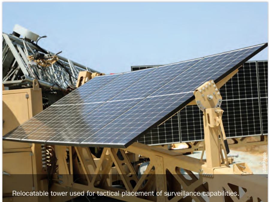
Relocatable tower used for tactical placement of surveillance capabilities.

be mutually beneficial in securing their borders from potentially nefarious activity, while slowing traffic transiting through those nations on the way to the U.S. border. Investments in biometric identification technologies allow us to identify potential targets of interest and provide an early warning of threats in the hemisphere. Expanding deployments of foreign liaisons and working with attaché offices to enhance the USBP's capabilities overseas will foster stronger foreign partnerships and support. ■