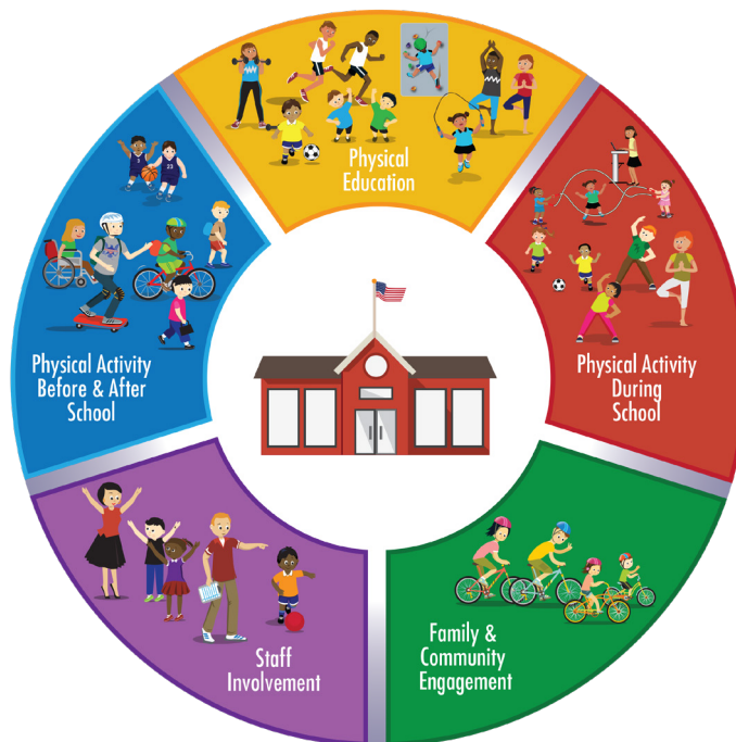
Comprehensive School Physical Activity Program (CSPAP)

Physical activity is defined as any bodily movement produced by skeletal muscles that requires energy expenditure. 7 Examples include walking, running, swimming, and yoga.