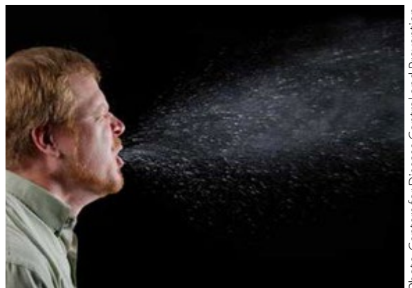
Airborne droplets visible during sneezing (photo enhanced).

Healthcare personnel who care for patients with ATDs must work in close proximity to the source of the hazard; even with controls in place, they are likely to have a higher risk of inhaling infectious aerosols (droplets and particles) than the general public. These personnel, and others with a higher risk of exposure related to the tasks they perform (e.g., lab or autopsy workers), must often be protected further through the proper use of