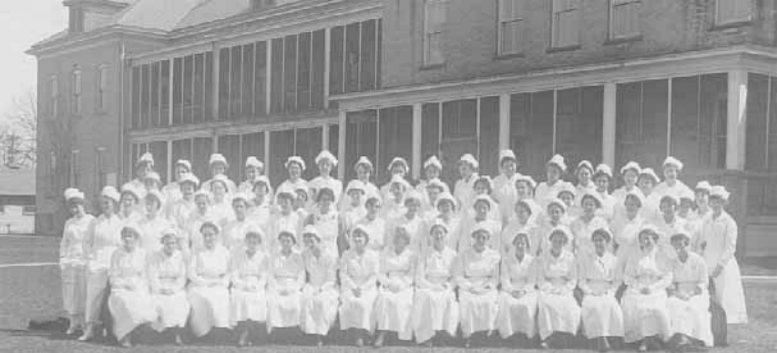
NURSE CORPS U.S. GEN. HOSPITAL NO. 20 FORT SNELLING MINN.