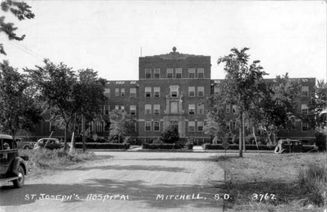
ST. JOSEPH'S HOSPITAL MITCHELL, S. D. 3762