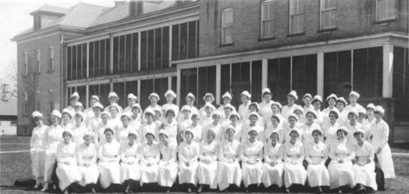
NURSE CORPS U.S. GEN. HOSPITAL NO. 29 FORT SNELLING MINN.