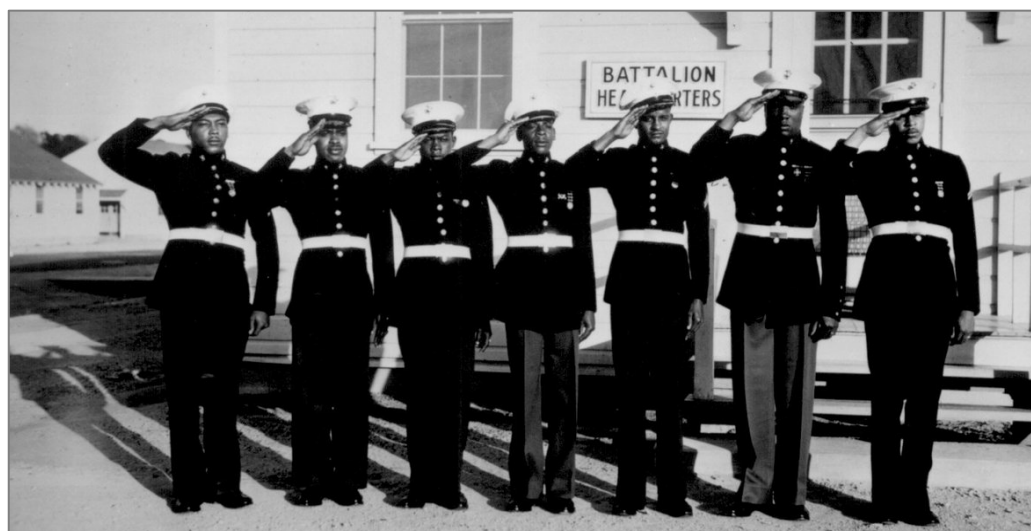
Montford Point Marines in dress uniform, 1943.