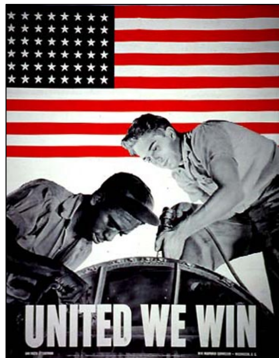
1943 "United We Win" war poster.