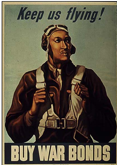
War bonds poster, 1943.

The Tuskegee Airmen served in the African-American flying units of the U.S. Army Air Forces during World War II, credited with 1,491 missions. They served as pilots, navigators, bombardiers, engineers, quartermasters, warrant officers, support and medical personnel, and instructors. However, until 1940, the U.S. military denied them the opportunity to fly. Thus the flight school at Tuskegee, AL, began as a civilian pilot-training program under the Civilian Aeronautics Administration. Engineering professors from Auburn University introduced the men to aviation; flight instruction took place at a municipal airport.