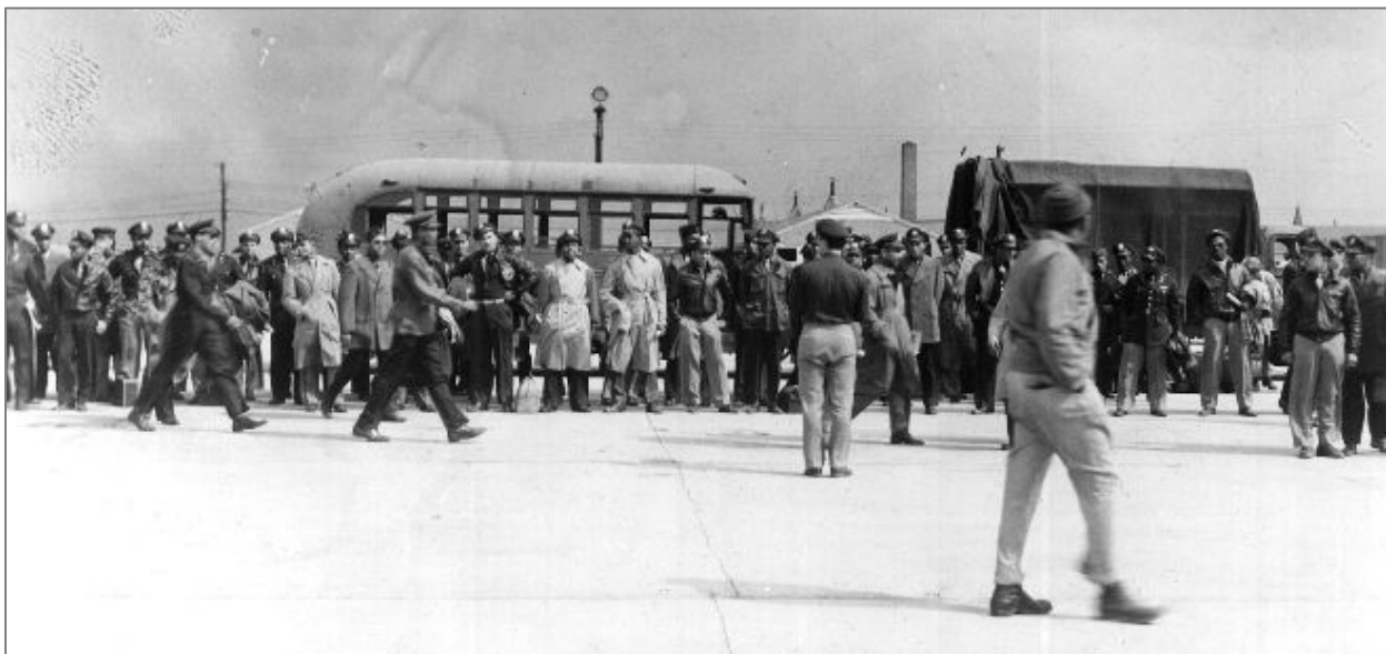
Review of officers during the Freeman Field Mutiny of 1945, Freeman Field, Indiana.