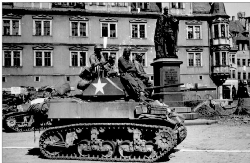
Clockwise from top left: U.S. Army field office in the Greek Temple of Neptune built 700 BC, September 1943 (NARA); Army nurses arrive in Scotland, August 1944 (NARA); 761 st Tank Battalion in Germany, April 1945, was the first African-American tank battalion to fight, earning 4 campaign medals, 11 Silver Stars, 69 Bronze Stars, about 300 Purple Hearts, and one Medal of Honor and Presidential Citation. (Army)