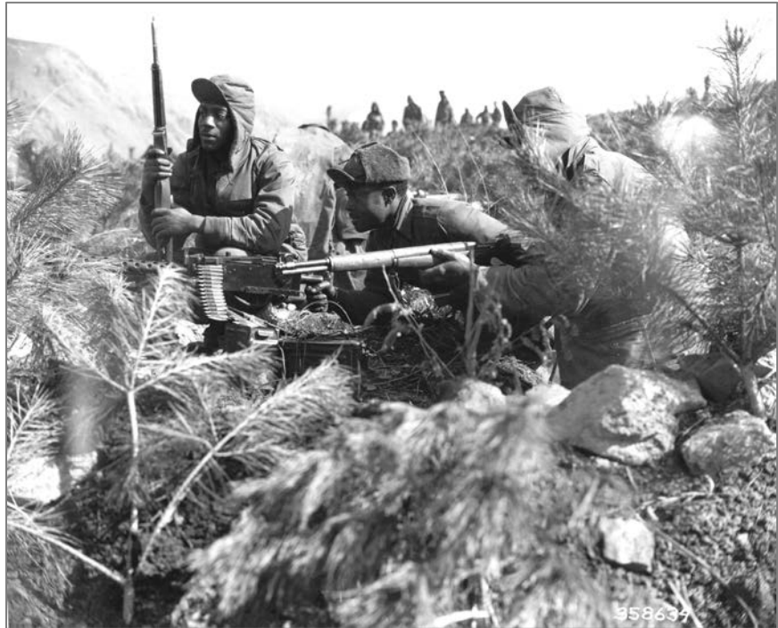
Machine gun division, 25 th Infantry, in Korea in February 1951.