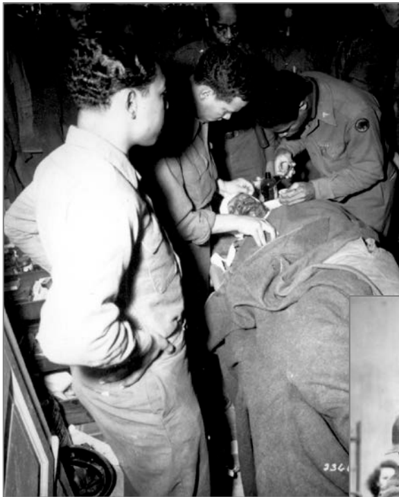
Medical treatment by the 92 nd Division in Italy, February 1945, left, and below, U.S. and French soldiers, February 1945.