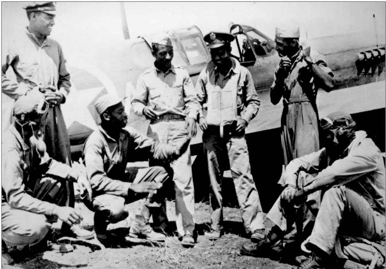
Members of the 99 th Fighter Squadron, Tuskegee Airmen, February 1944.