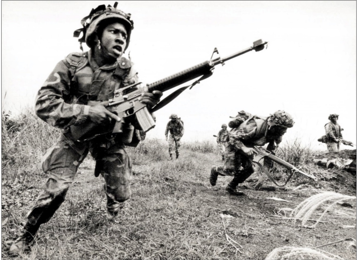
"Engaging the Enemy," 1969.