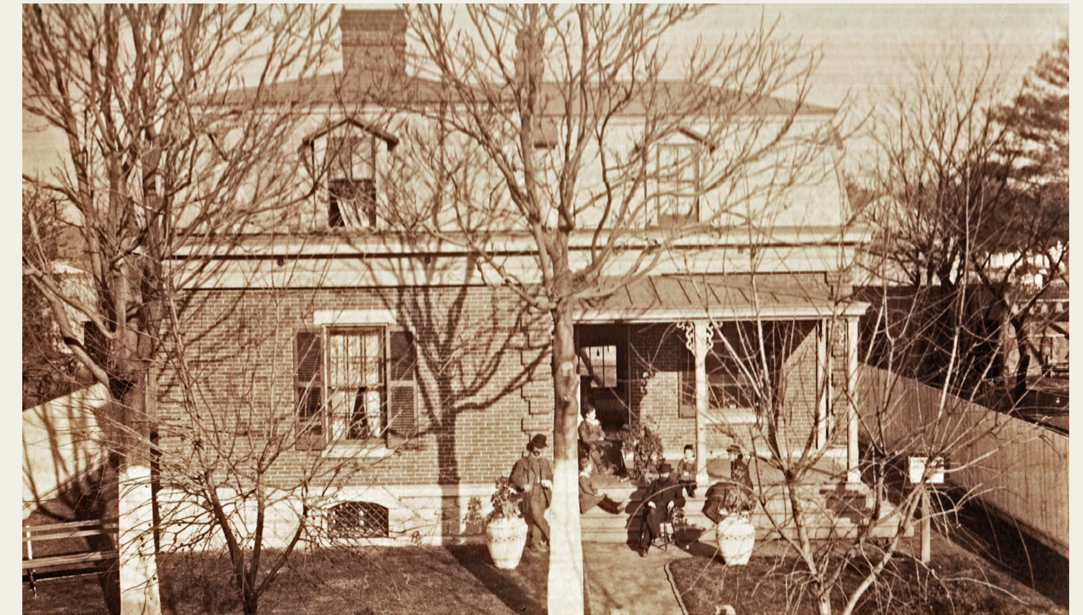
Superintendent's lodge, 1882. The Second Empire-style building, constructed in 1877 outside the cemetery wall, was sold in 1938. National Archives and Records Administration.