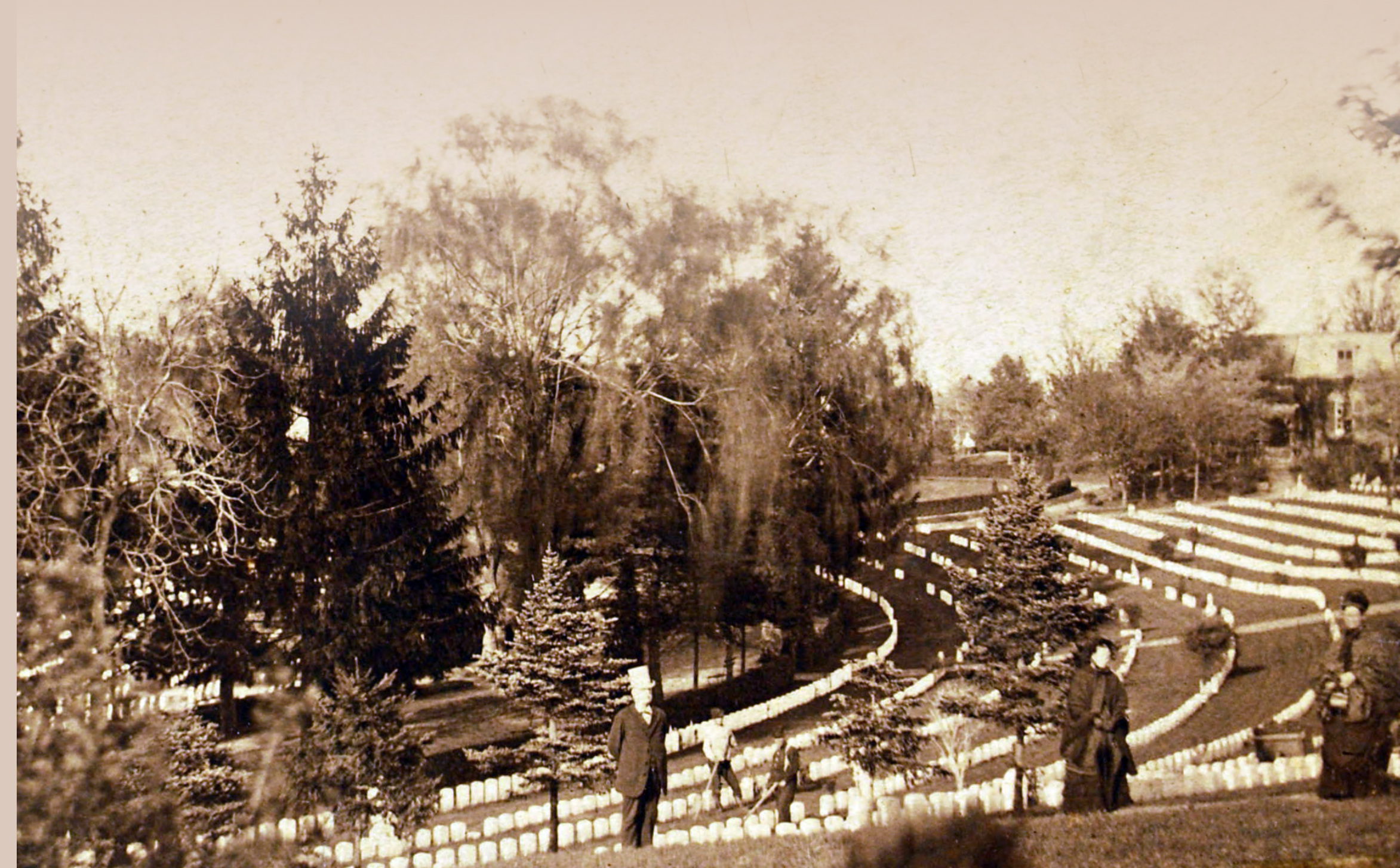
Union Grounds, c. 1880, with lodge in background at right. National Records and Archives Administration.

Union soldiers originally buried at Fort Hamilton, Governor's Island, and Fort Wadsworth in New York City, and Mount Hope Cemetery in Otisville, New York, were reinterred in the new Jamaica Avenue tract. This move raised the number of Union dead in the national cemetery to 5,222; of these, 373 were unknown.