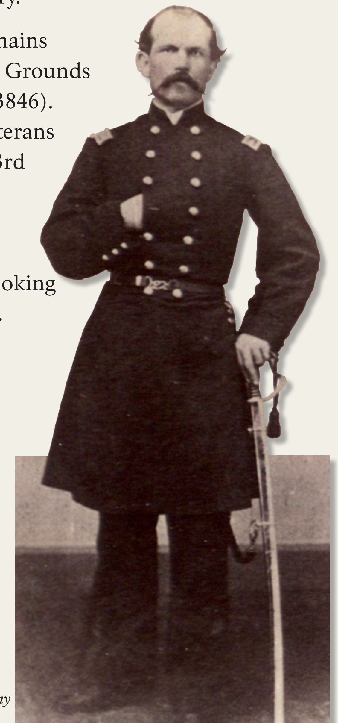
Col. Benjamin Ringold, c. 1862.

The ceremony was attended by Civil War veterans including former members of the regiment, several Grand Army of the Republic posts, and Brooklyn residents.