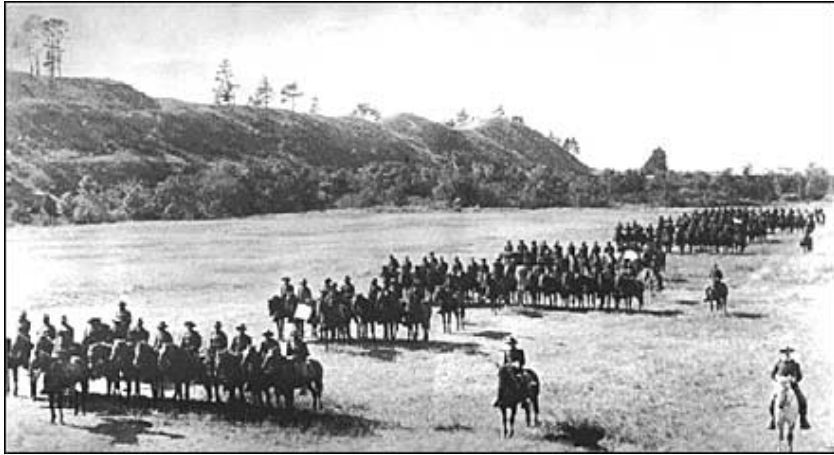
Buffalo Soldiers (9th Cavalry) at Fort Robinson, Nebraska, 1889.

In 1866 the Army Reorganization Act authorized the formation of 30 new regiments. Based on the outstanding U.S. Colored Troops (USCT) performance in the Civil War, it included six all-black units: the 9th and 10th Cavalry, and the 38th, 39th, 40th and 41st Infantry regiments. A consolidation in 1869 reorganized the four units of foot soldiers into the 24th and 25th infantry regiments. Cavalry