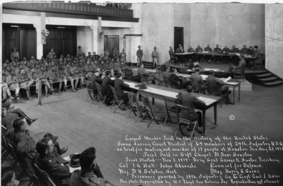
Courtroom scene during the first trial of those charged in the riots of August 23, 1917.

False reports that Baltimore had been killed at the hands of white police incited some soldiers from the 24 th to demand his release. That evening, the rumors led an estimated 150 men of the 24th Infantry to march two hours into Houston. The riot that ensued left sixteen white civilians dead, including four policemen and two National Guardsmen. Four black soldiers died, two of whom were accidentally shot by their comrades.