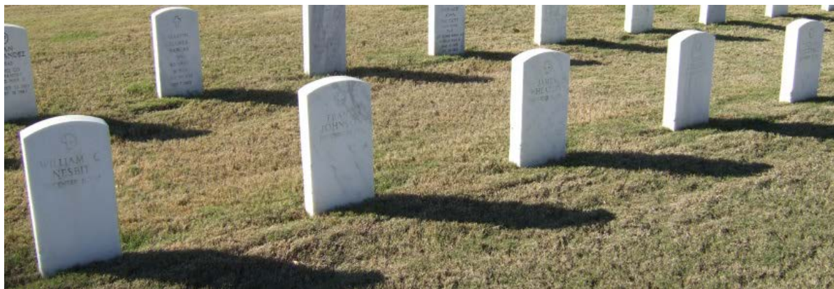
Graves of 17 Houston Riot victims buried at Fort Sam Houston National Cemetery.

While African-Americans continued to face discrimination at home, in their civilian and military lives, on the battlefields abroad their service was recognized and appreciated. Established regiments of black soldiers – the cavalry and infantry honorifically known as Buffalo Soldiers – were posted to the U.S.-Mexican border in the 1910s, but individuals from those regiments and new enlistees joined the war effort in Europe in other divisions. Members of the 25 th Infantry Regiment, for example, fought with French troops on the front lines as part of the 93 rd Infantry Division.