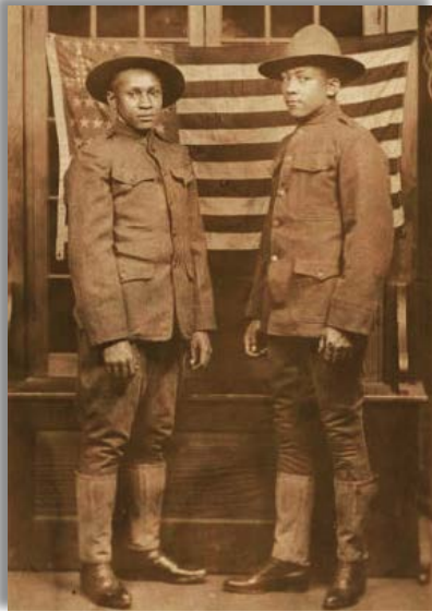
Two unidentified African American soldiers, 1917-1918.

to sergeant, but he died later that year, on September 30, 1916. He is buried in San Francisco National Cemetery (Section WS, Grave 1036-A).