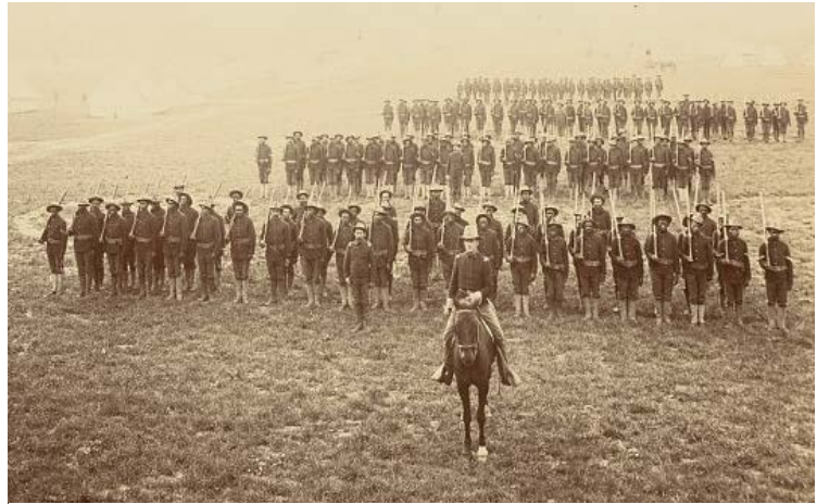
African American soldiers at Camp Meade, PA, 1899.

The 10-month-long Spanish-American War of 1898 resulted in Spain relinquishing its claim on Cuba, and ceding Guam, Puerto Rico, and the Philippines to the United States. Significant battles were waged, but the best known in popular history is the charge up San Juan Hill that took place July 1, 1898, in Cuba, because of Teddy Roosevelt and his "Rough Riders." Yet an estimated 200,000 volunteers and National Guard units fought in the Spanish-American War, including 3,339 African-American regulars and about 10,000 volunteers.