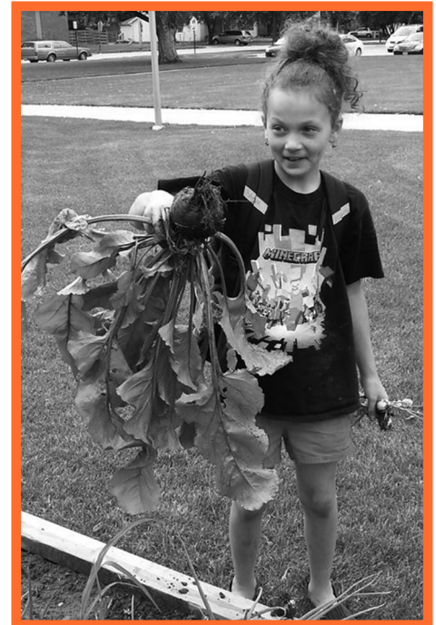
The kids in Fremont, Nebraska, enjoyed all aspects of gardening from digging in the dirt to showing off their vegetables from their After School Garden.