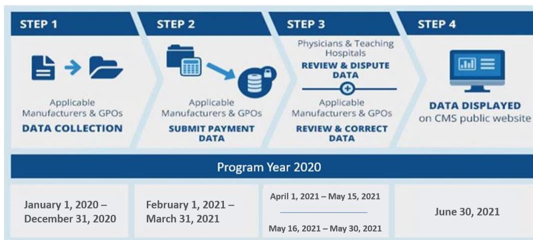
Figure 2. Open Payments Program Cycle Overview

In Program Year 2020, reporting entities collectively reported $9.12 billion in publishable payments and ownership and investment interests made to covered recipients. This amount is comprised of 6.38 million total records attributable to 487,152 physicians and 1,213 teaching hospitals.