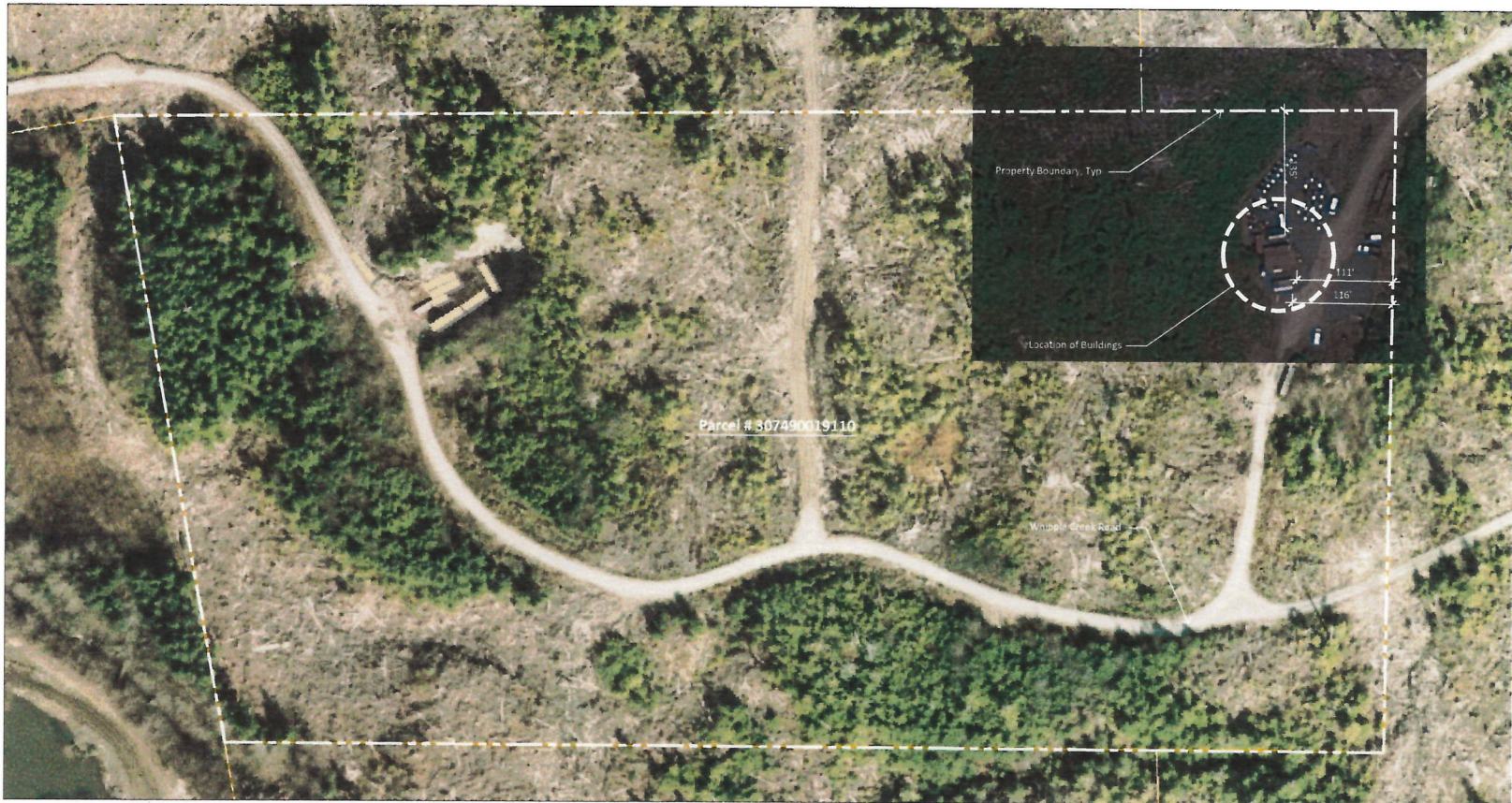
1 Vicinity Plan