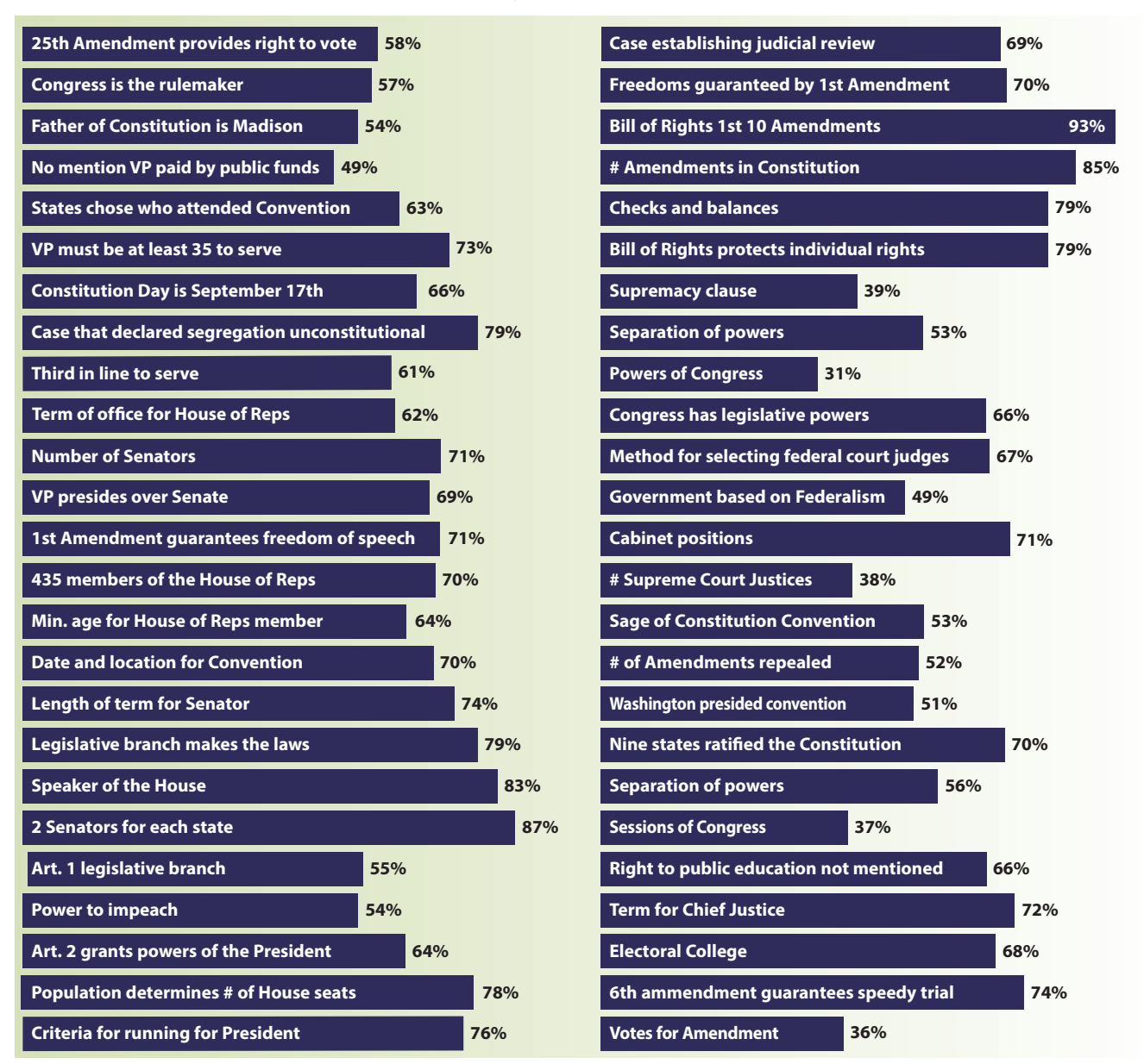
Chart 6: 50-Question Expanded Quiz Scoring (Expert Quiz #2 — ConstitutionFacts.com)

© 2024 Oak Hill Publishing Company. All rights reserved.