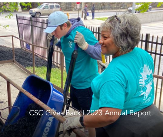
CSC Gives Back | 2023 Annual Report

CSC prioritizes the initiatives and causes that are the most important to our colleagues. We rally behind the efforts championed by our people to ensure the greatest possible benefit.