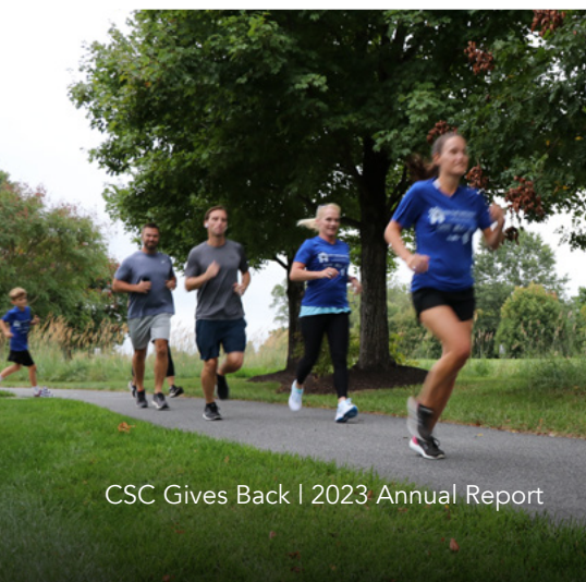
CSC Gives Back | 2023 Annual Report